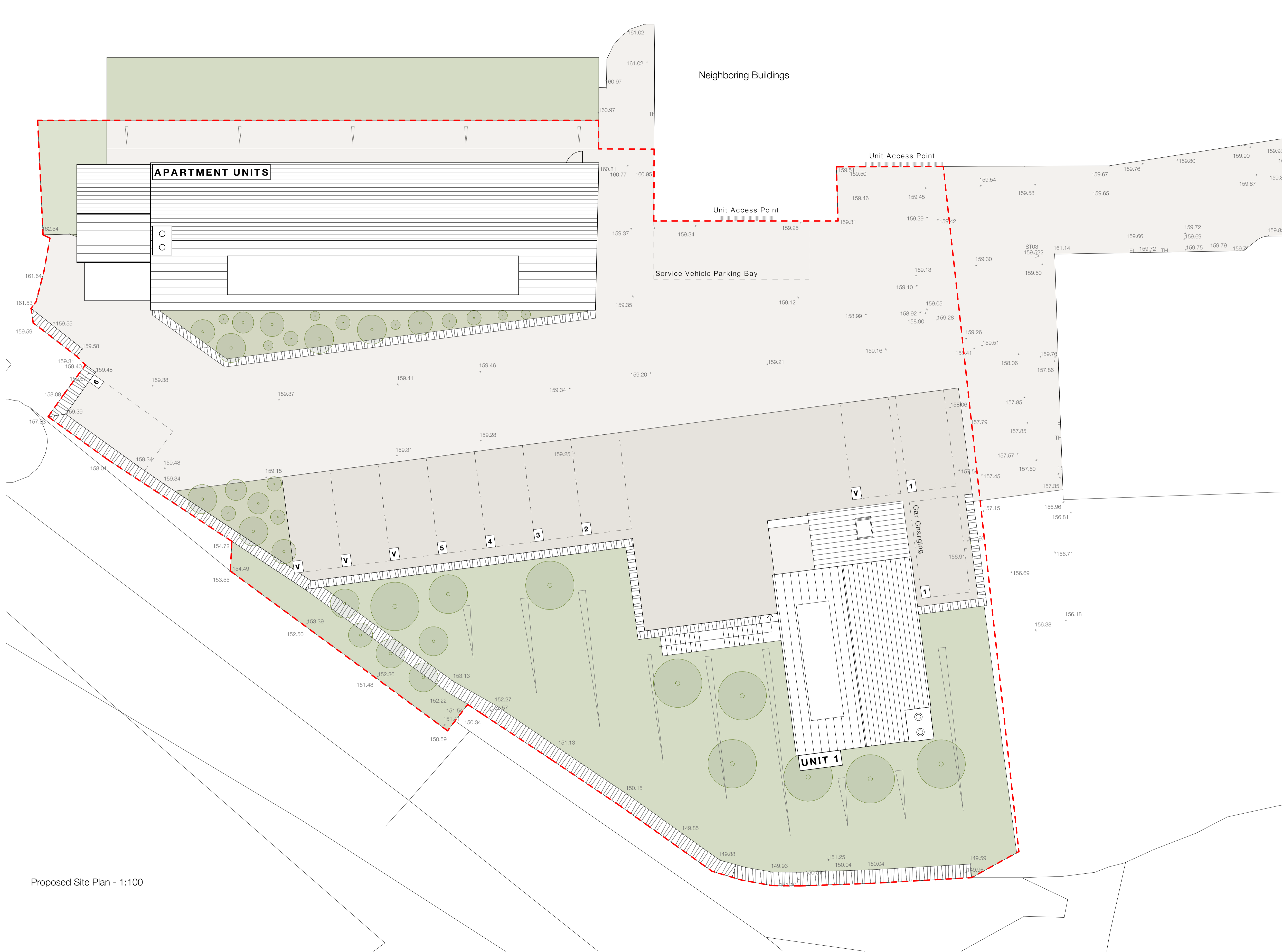
Proposed Site Plan - 1:100