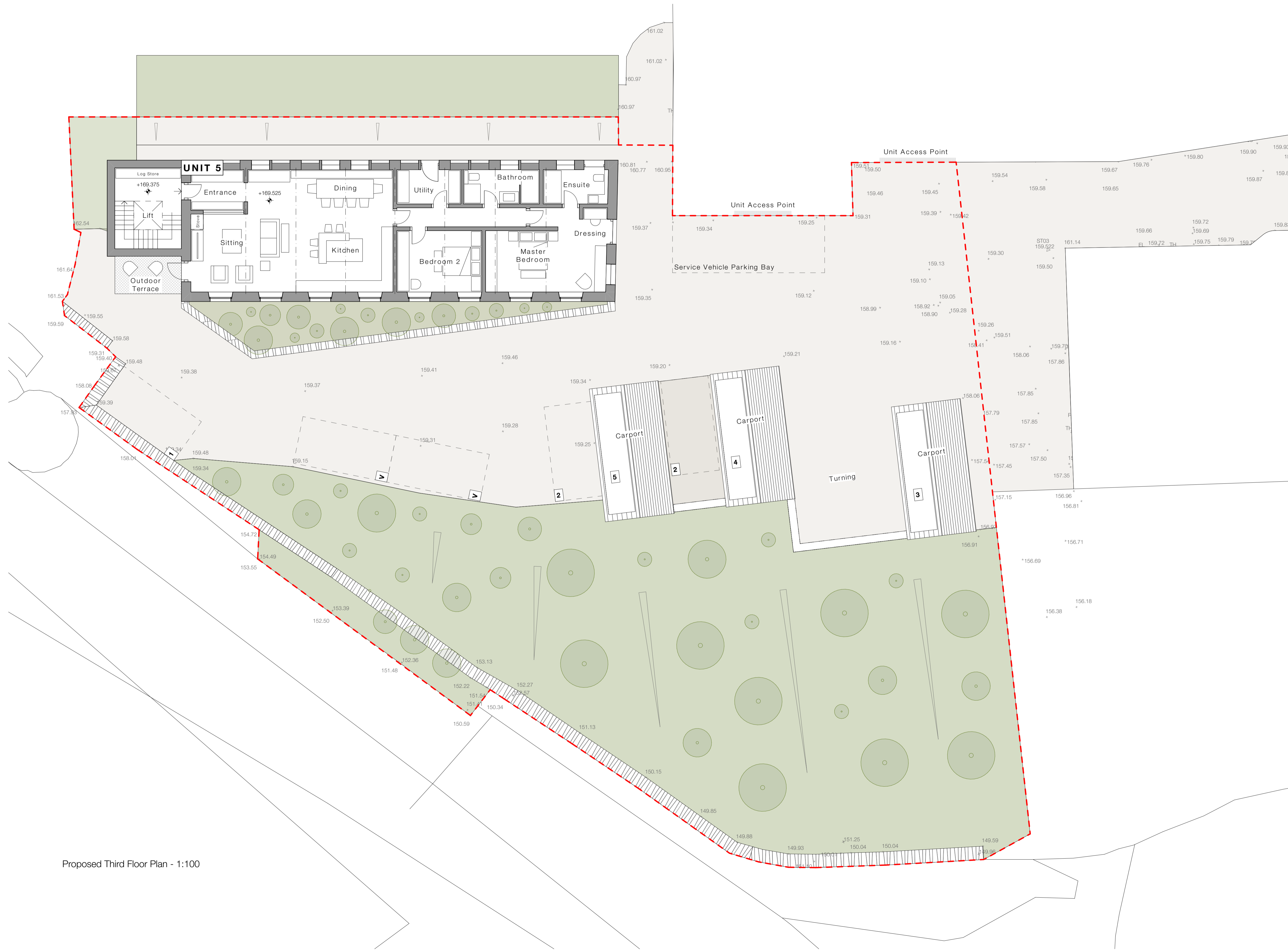
Proposed Third Floor Plan - 1:100