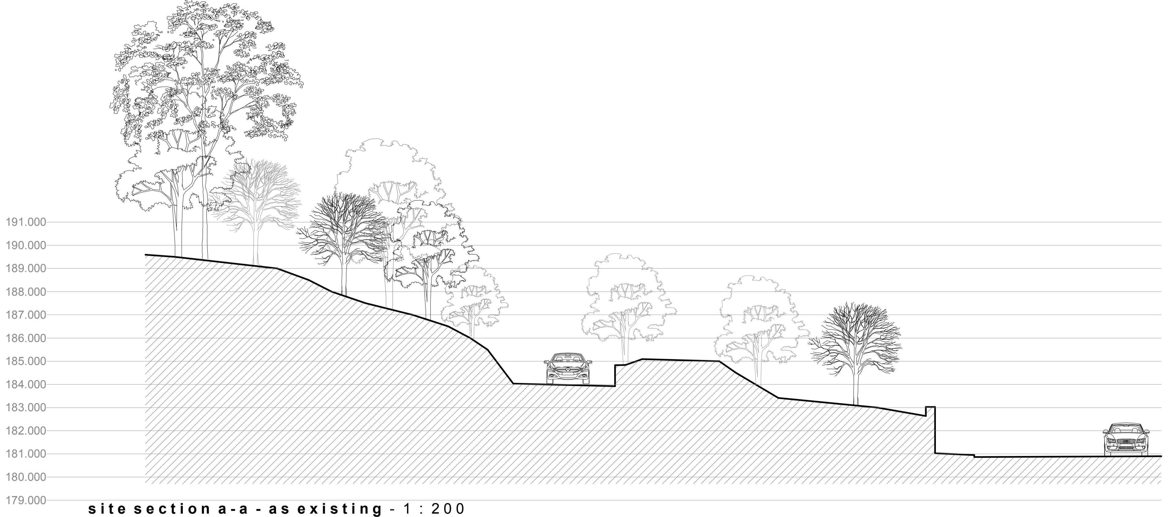
site section a-a - as existing - 1 : 200

This drawing has been prepared specifically for the purpose of obtaining Planning Permission and/or Building Regulation Approval. Its suitability for other purposes, without supplementary details and specifications cannot be guaranteed. The Permissions and/or Approvals are beyond the Architects control and no guarantee that such will be granted is given or to be inferred by reason of the preparation of this drawing. Only figured dimensions are to be used. All dimensions to be checked on site. This drawing together with the design is the property and copyright of the Architect and must not be reproduced without prior written permission.