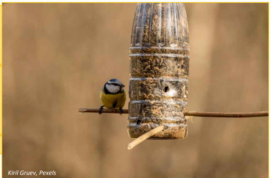
Kiril Gruev, Pexels