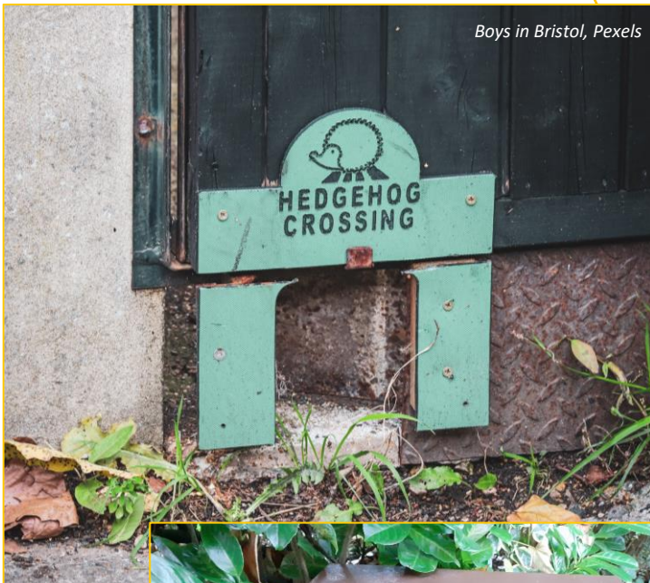
Boys in Bristol