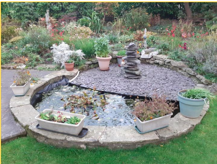
Phil Hearing, Unsplash

If a pond is not feasible, or you don't have the space or capacity for a pond in your garden, why not consider a mini pond? This can be as simple as a large pot or container either dug into the ground or sat above ground. The same principles apply to your mini pond as its full-size counterpart. Make sure there is some kind of ramp to allow animals to safely enter and exit the water. Ensure there are some plants in and around the water's edge, to provide cover and food sources, and place the mini pond in a relatively sheltered area of your garden, to prevent it sitting in full sunlight.