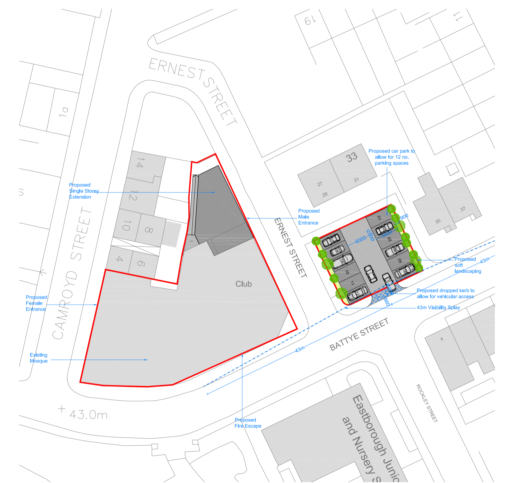
PROPOSED SITE PLAN Scale 1:500@A1