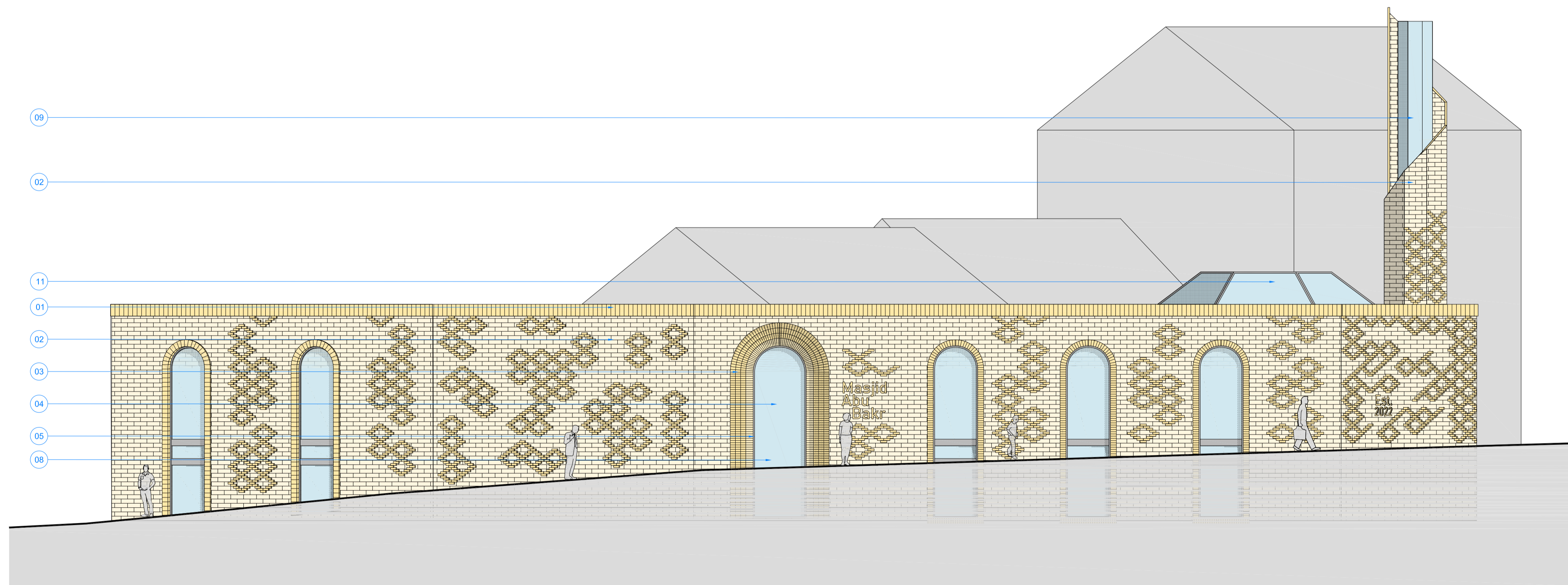
PROPOSED BATTYE STREET ELEVATION Scale 1:100@A1