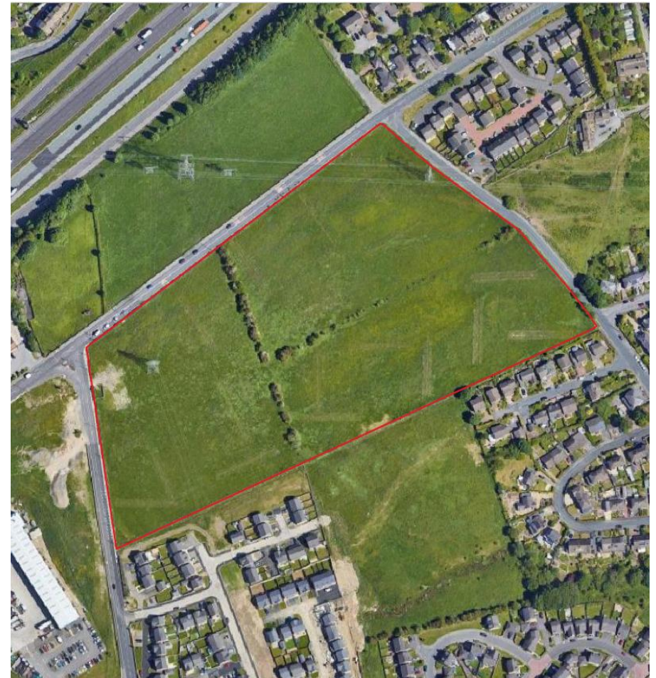
Figure 2.1 Site area under assessment (red line)