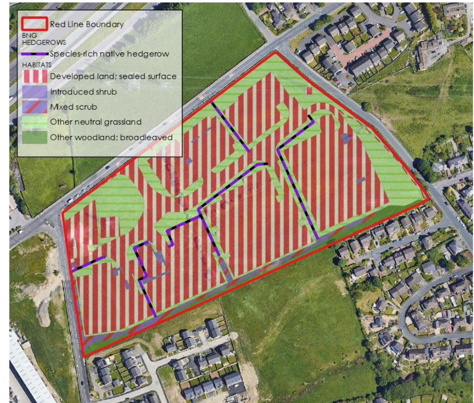
Figure 7.1 Post development habitat types (*trees not shown)