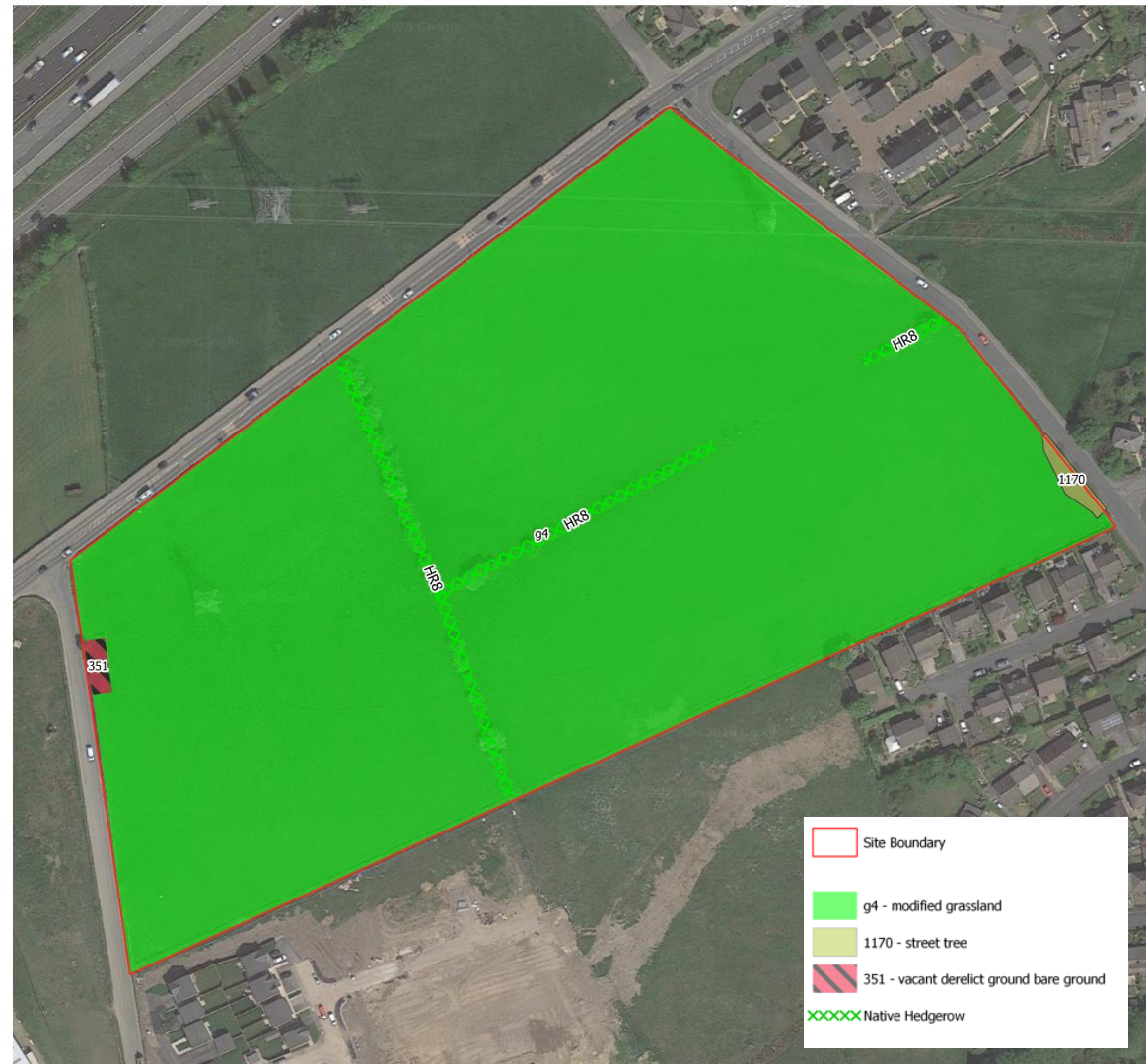
Figure 3.1 The Site's habitats

3.1.6. If left un-managed/un-grazed, the habitats on site would likely succeed to taller ruderal vegetation and scrub over time.