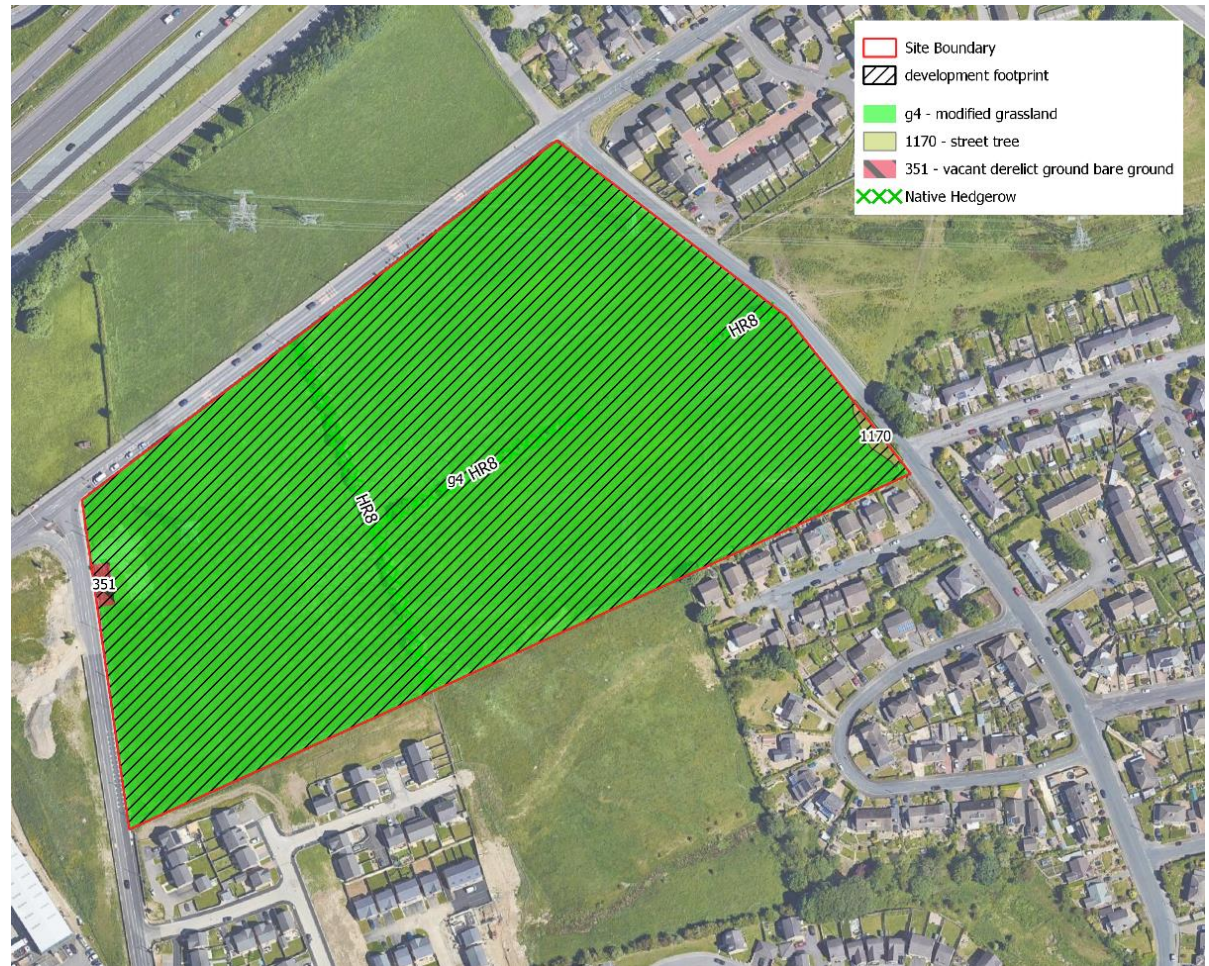
Figure 5.1 Development footprint in relation to existing on-Site habitats