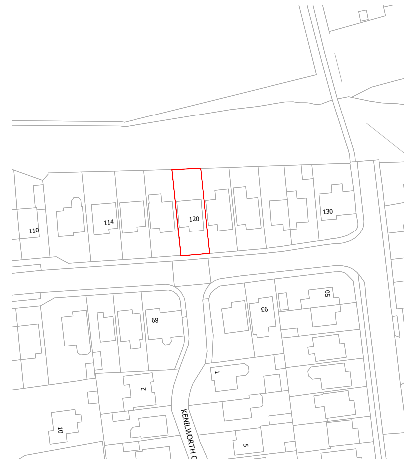
Site Plan 1-1250 Scale