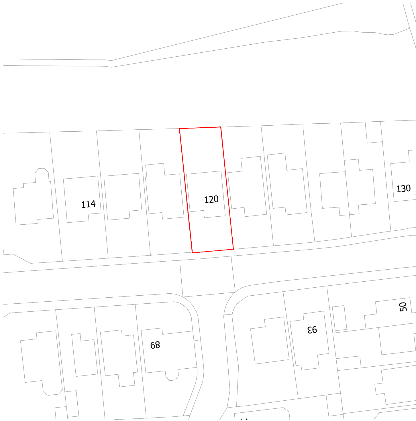
Site Plan 1-500 Scale