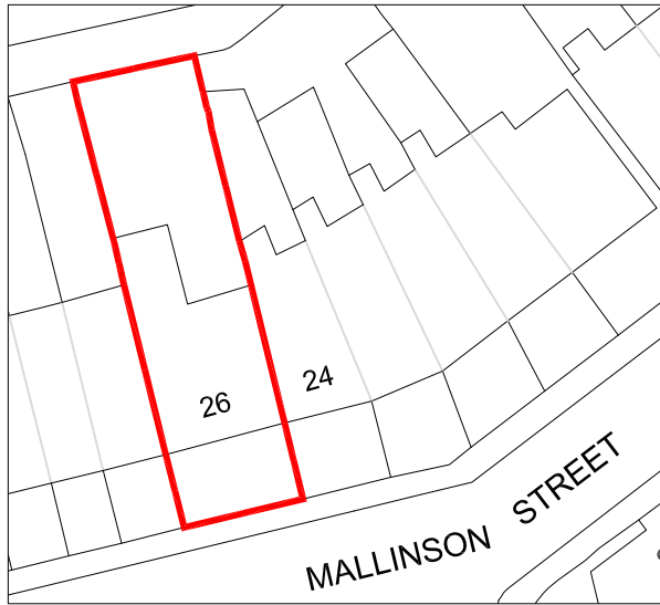
EXISTING SITE PLAN (1:500@A4)