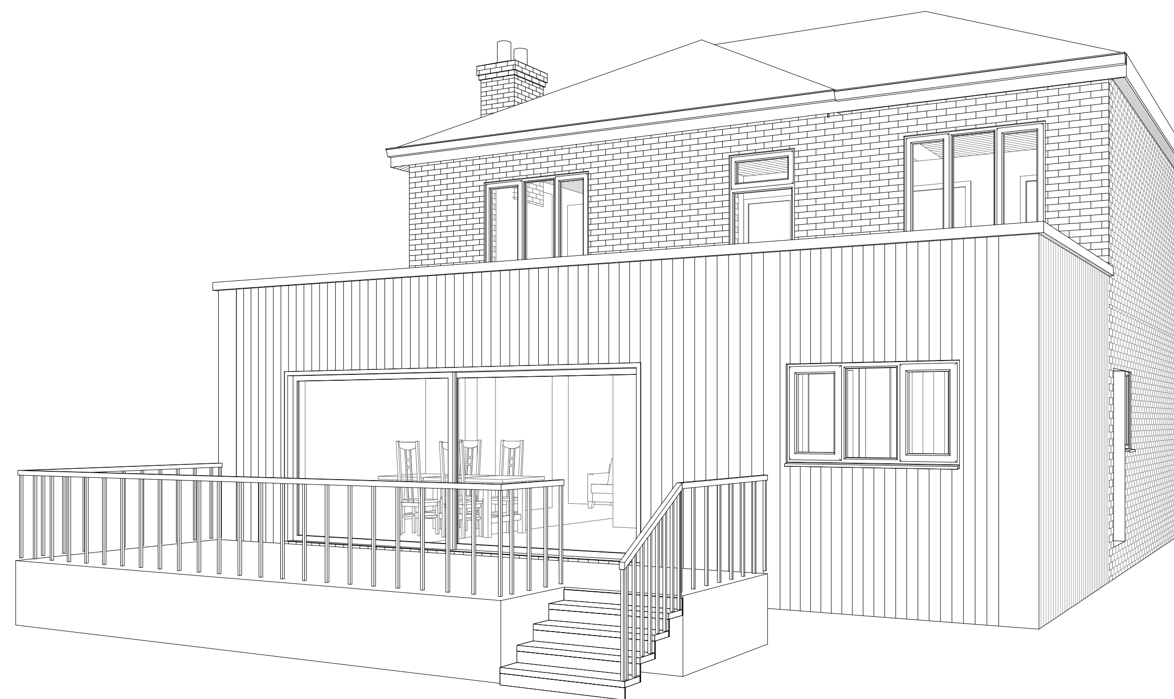
3D View 4 Proposed