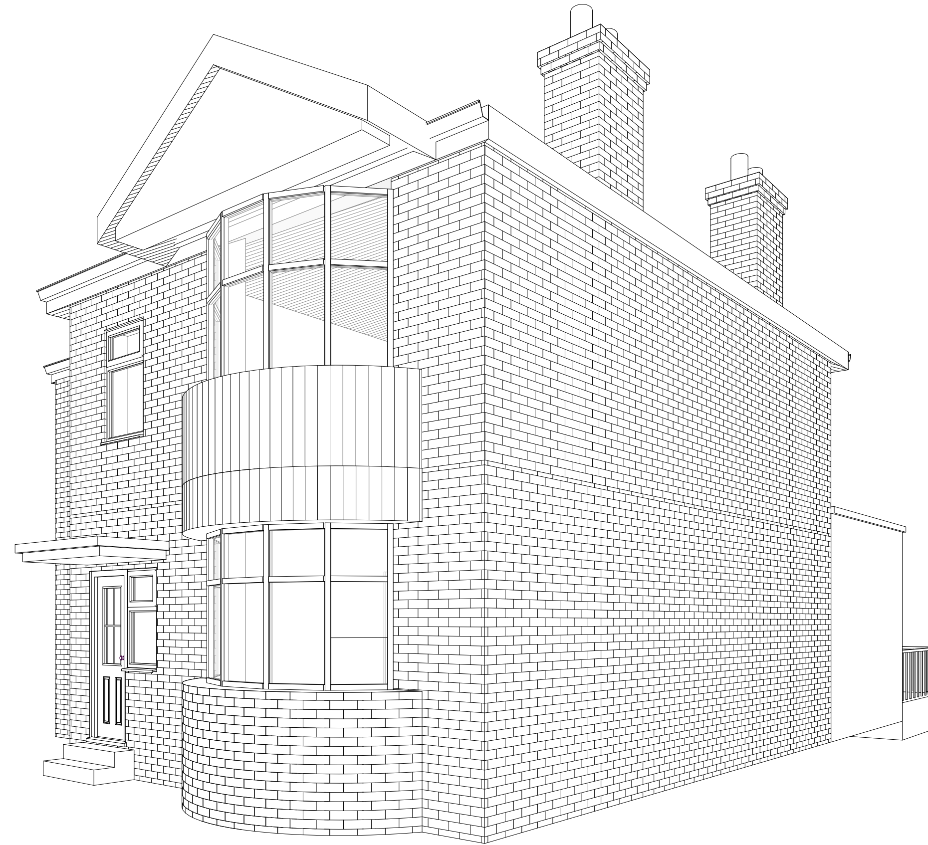
3D View 2 Proposed