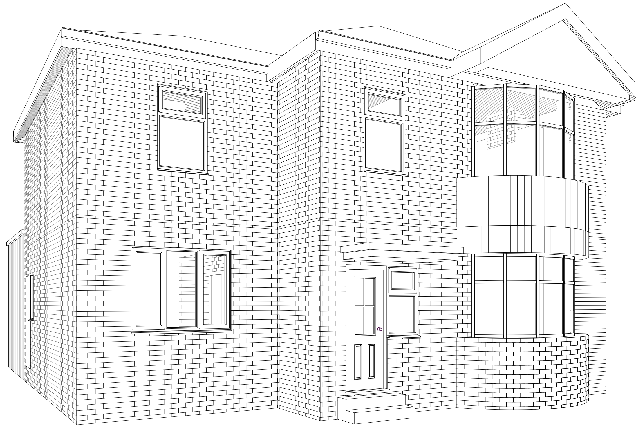
3D View 1 Proposed

PLEASE DO NOT SCALE DIRECTLY FROM THIS DRAWING MAIN CONTRACTOR TO CHECK ALL MEASUREMENTS ON SITE PRIOR TO CONSTRUCTION. THE SITE PLAN IS BASED ON THE INFORMATION PROVIDED VIA THE ORDNANCE SURVEY PLAN AND SUBJECT TO A DETAILED SITE SURVEY. THE LAYOUT OF THE GARDEN IS AN INDICATION ONLY. ALL MEASUREMENTS (POSITIONS OF WALLS, PATHS, MANHOLES) MUST BE CHECKED ON SITE AND NOT TAKEN FROM THIS DRAWING. STRUCTURAL ENGINEER TO PROVIDE ALL STRUCTURAL DETAIL DESIGN AND CALCULATIONS, WHERE REQUIRED. MAIN CONTRACTOR TO ENSURE ALL MECHANICAL AND ELECTRICAL SPECIFICATIONS ARE IN LINE WITH APPROVED DOCUMENTS PARTS B, L, F & P AND INSTALLED BY COMPETENT PERSONS. ALL NEW LIGHTING TO USE ENERGY EFFICIENT BULBS (WITH APPROPRIATE IP RATINGS FOR BATHROOMS & EXTERNAL USE).