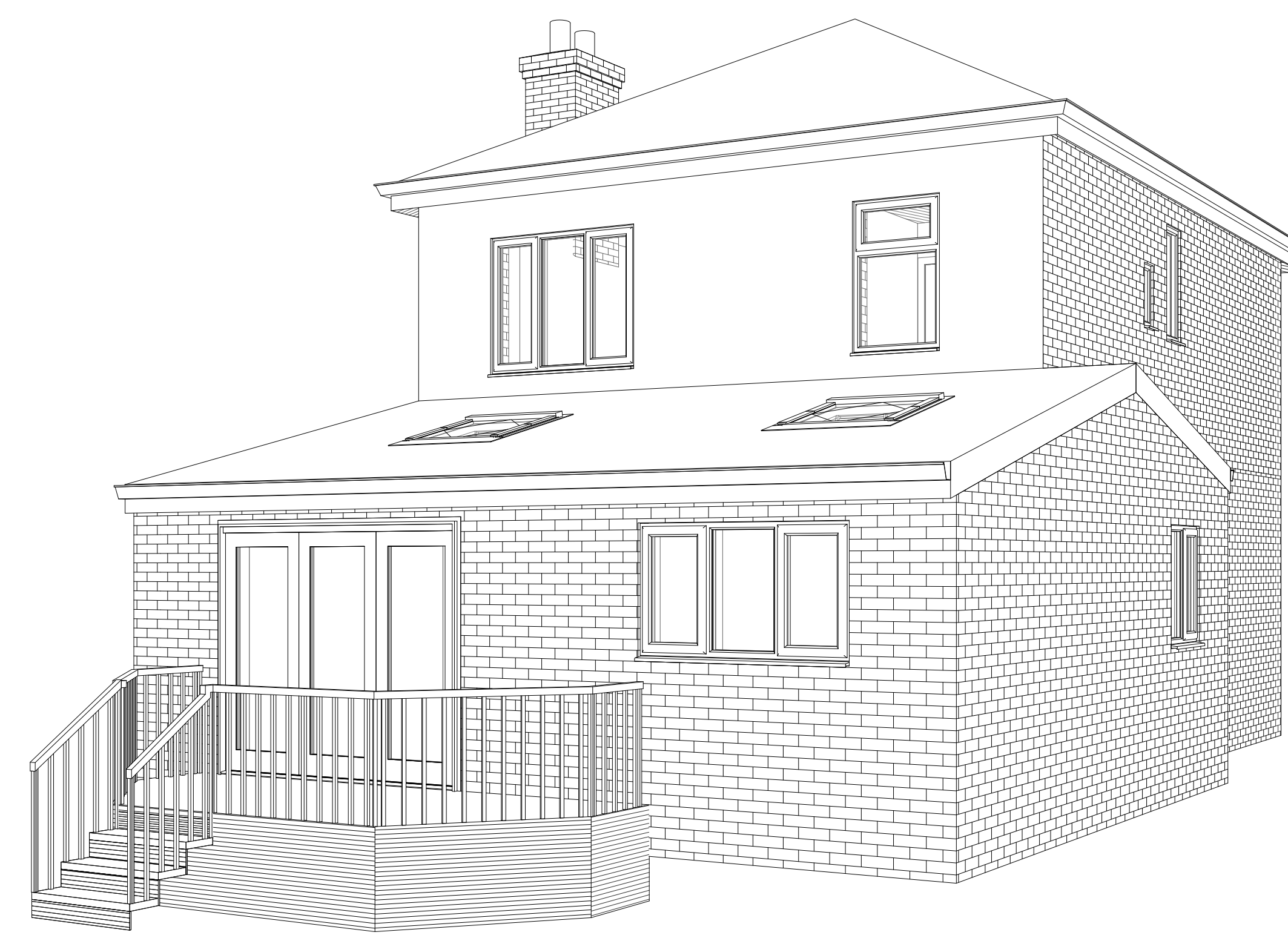
3D View 4