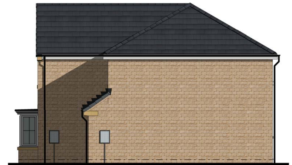
R.H. SIDE ELEVATION.

X INDICATES OPTIONAL INTERNAL DOOR, CONFIRM WITH REGIONAL TECHNICAL TEAM OVER SITE SPECIFIC VARIATIONS.