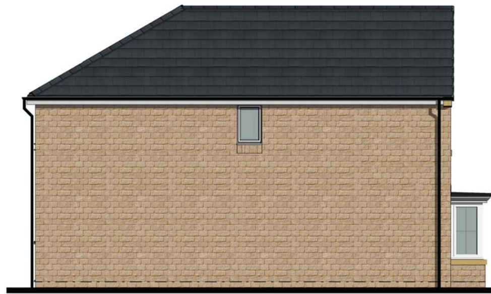
L.H. SIDE ELEVATION.