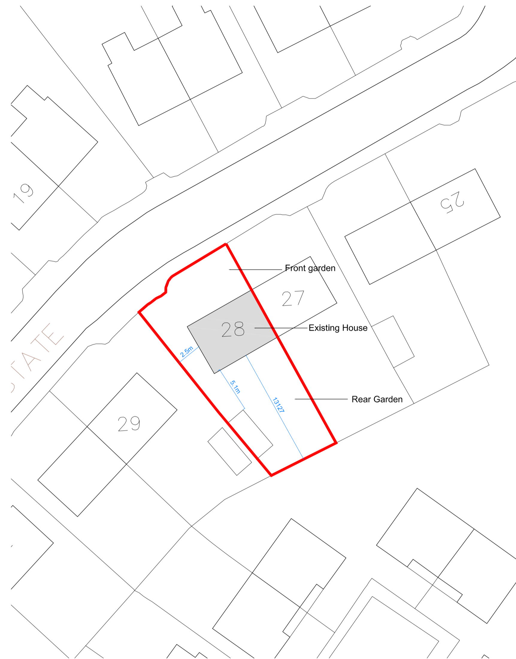
EXISTING SITE PLAN Scale 1:250@A1