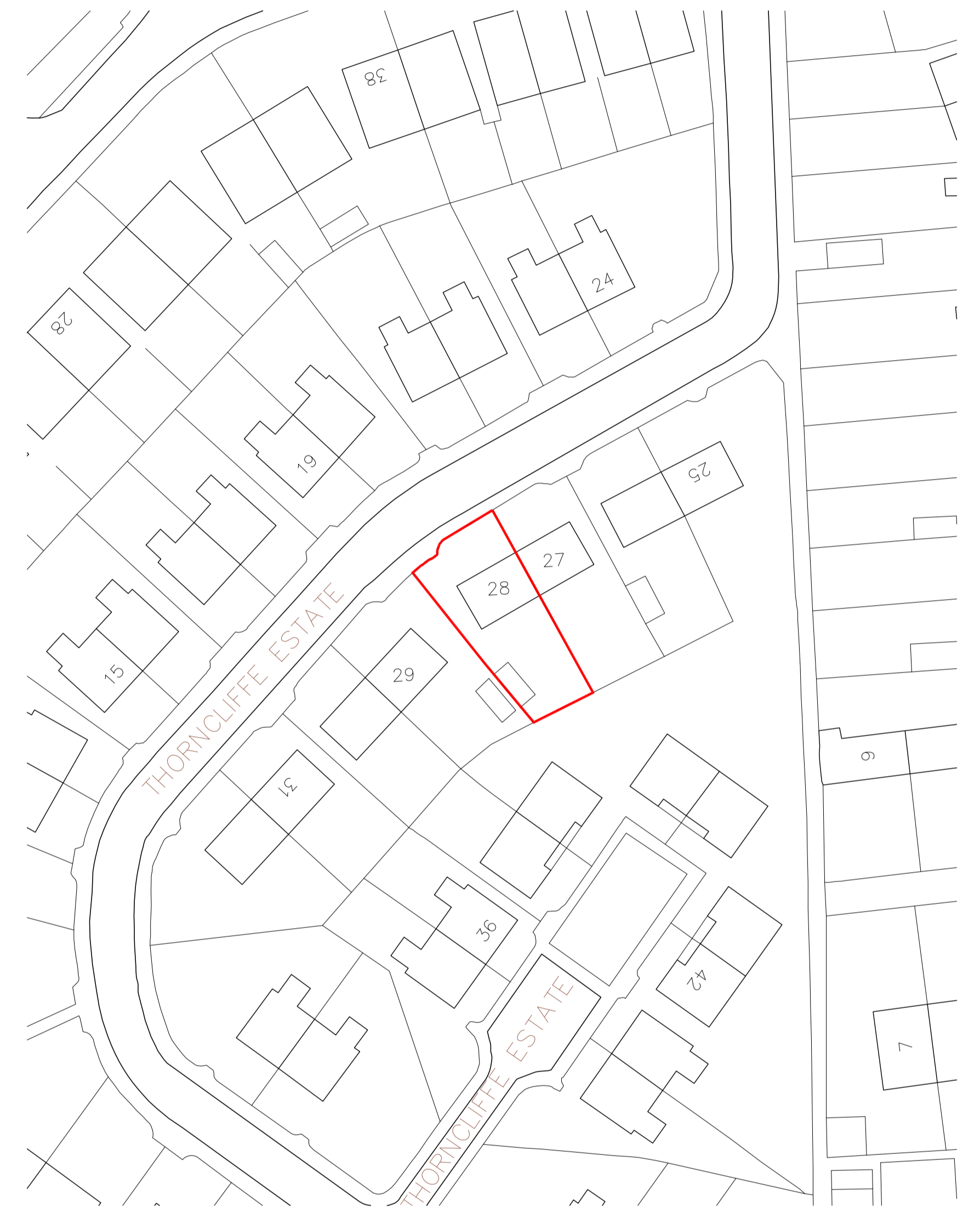
Location Plan Scale 1:500@A1

NOTE: Do not scale drawing. Work to figured dimensions. This drawing has been prepared for planning purposes only and is to be read in conjunction with all other relevant specialist drawings, details and specifications. All works are to be carried out in accordance with the latest edition of the Building Regulations and any amendments, together with all relevant British Standards and codes of practice. All dimensions unless noted otherwise are in millimetres. All dimensions and levels are to be checked by the contractor on site prior to order, installation or commencement of work on site. Contractor to check and satisfy himself of the positions of all existing statutory authorities marks services on and around site. All materials and proprietary items are to be fixed in situ/ applied in situ in accordance with the respective manufacturers recommendations. At all stages of work, the contractor shall be responsible for and must ensure the overall stability of all buildings, structures and excavations etc. is maintained. During the construction works all existing fire drainage is to be adequately protected and normal flows maintained.