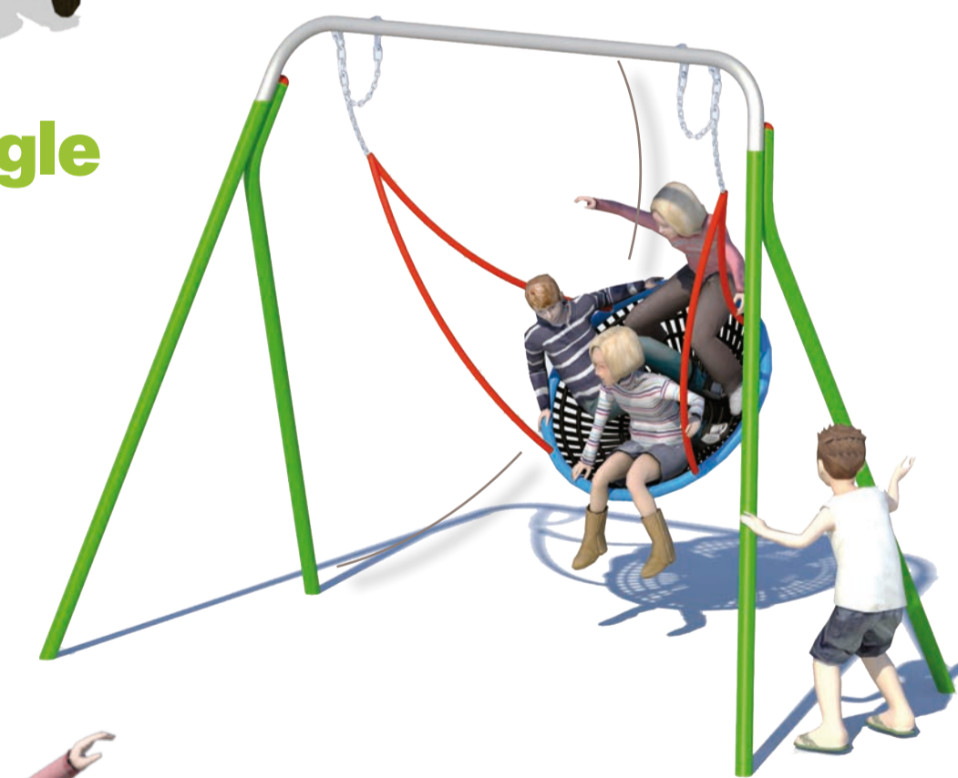
07 Nest Swing Inclusive item