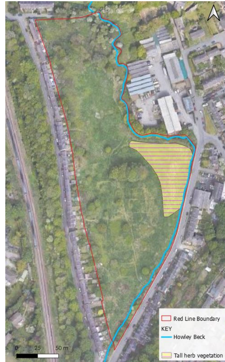
Figure 1 Survey extent - Howley Beck and Tall herb community