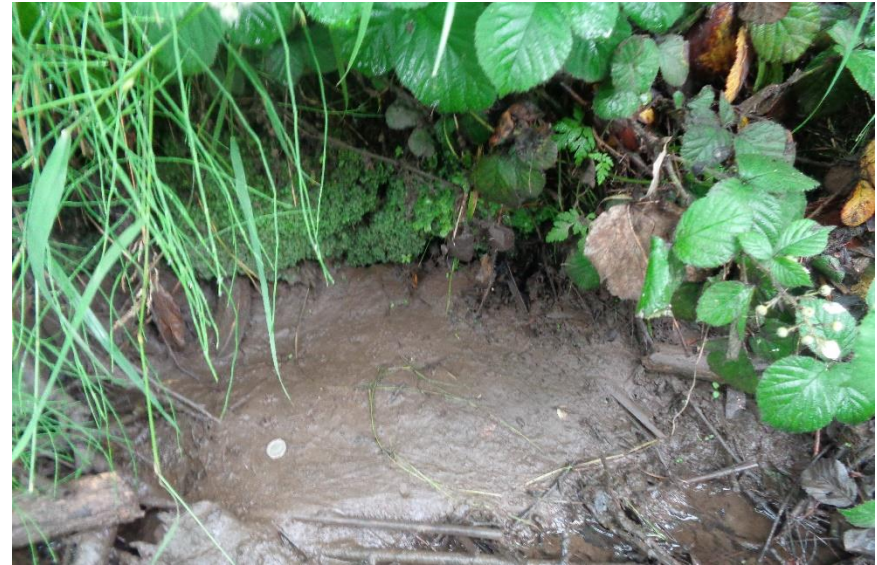
Figure 6 Typical view of the beck towards the southern end of the Site.