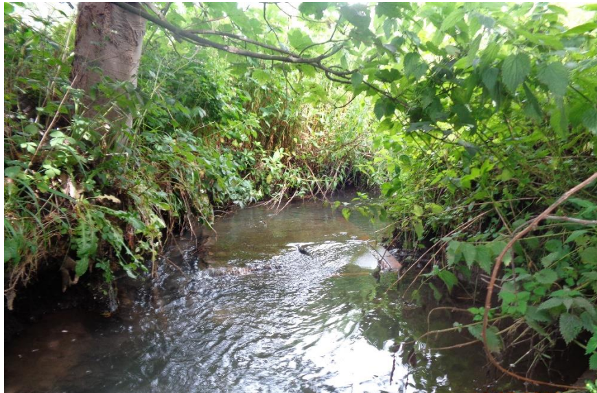
Figure 4 Typical view of the beck towards the northern end of the Site.