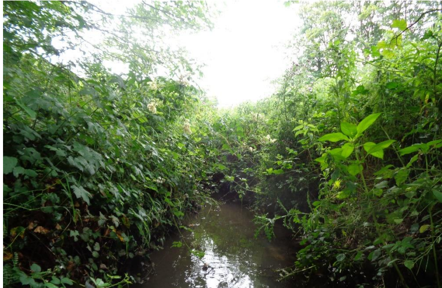
Figure 4 Typical view of the beck towards the northern end of the Site.