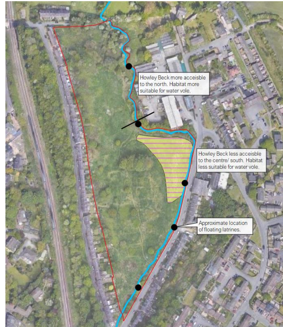
Figure 2 Survey extent - Howley Beck and Tall herb community