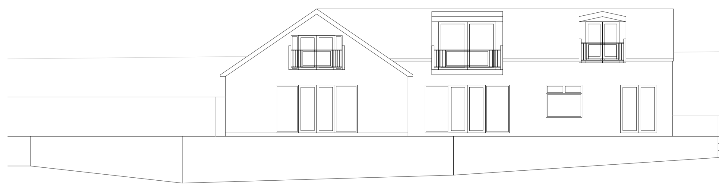
ES SOUTH ELEVATION 1:100