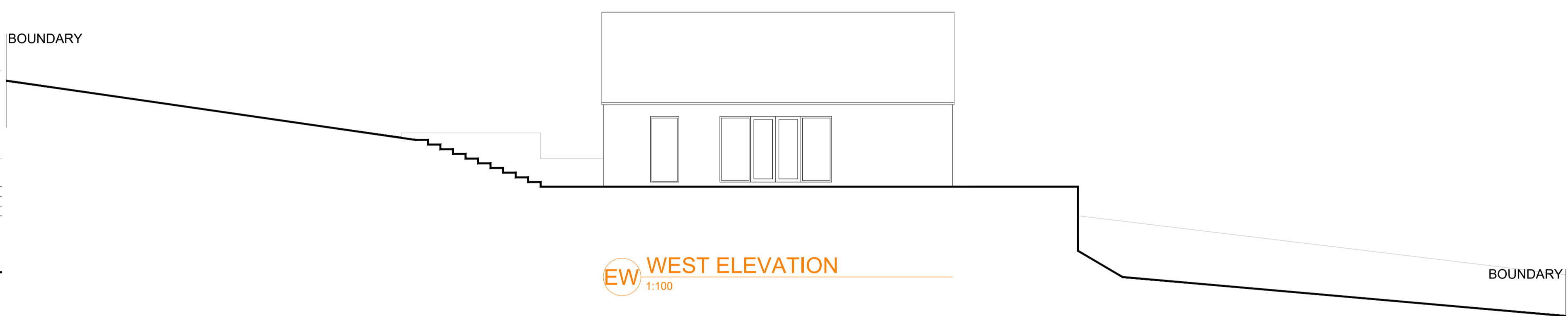
EW WEST ELEVATION 1:100