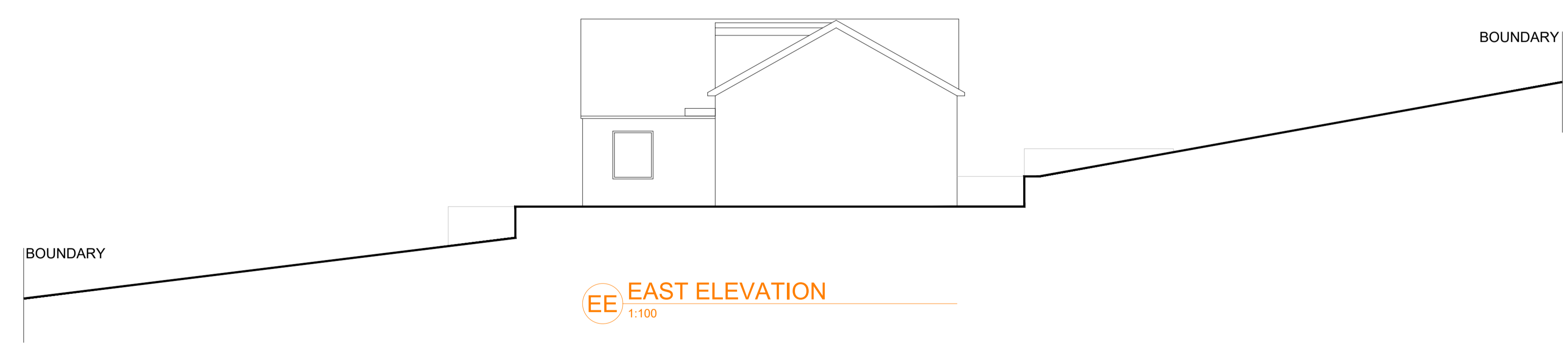
EE EAST ELEVATION 1:100