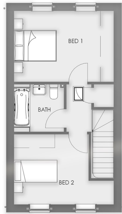
FIRST FLOOR LAYOUT 1 : 100