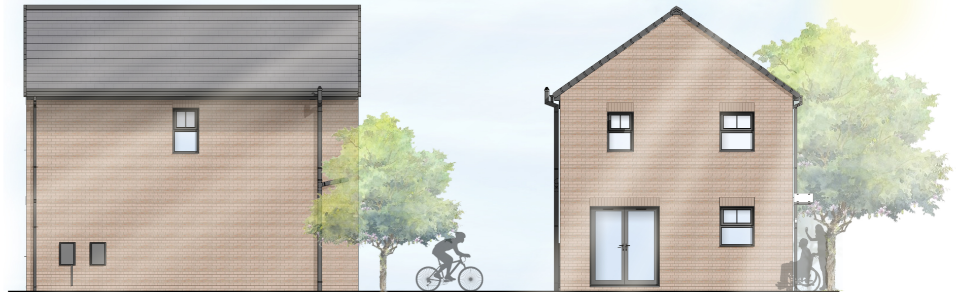
REAR VIEW 1 : 100