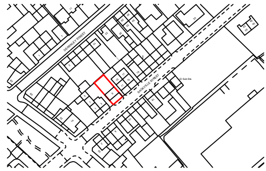
Block Plan Scale 1:1250