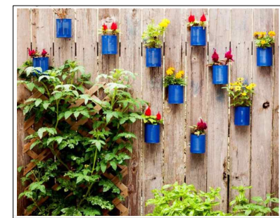
Timber Fencing idea with green wall