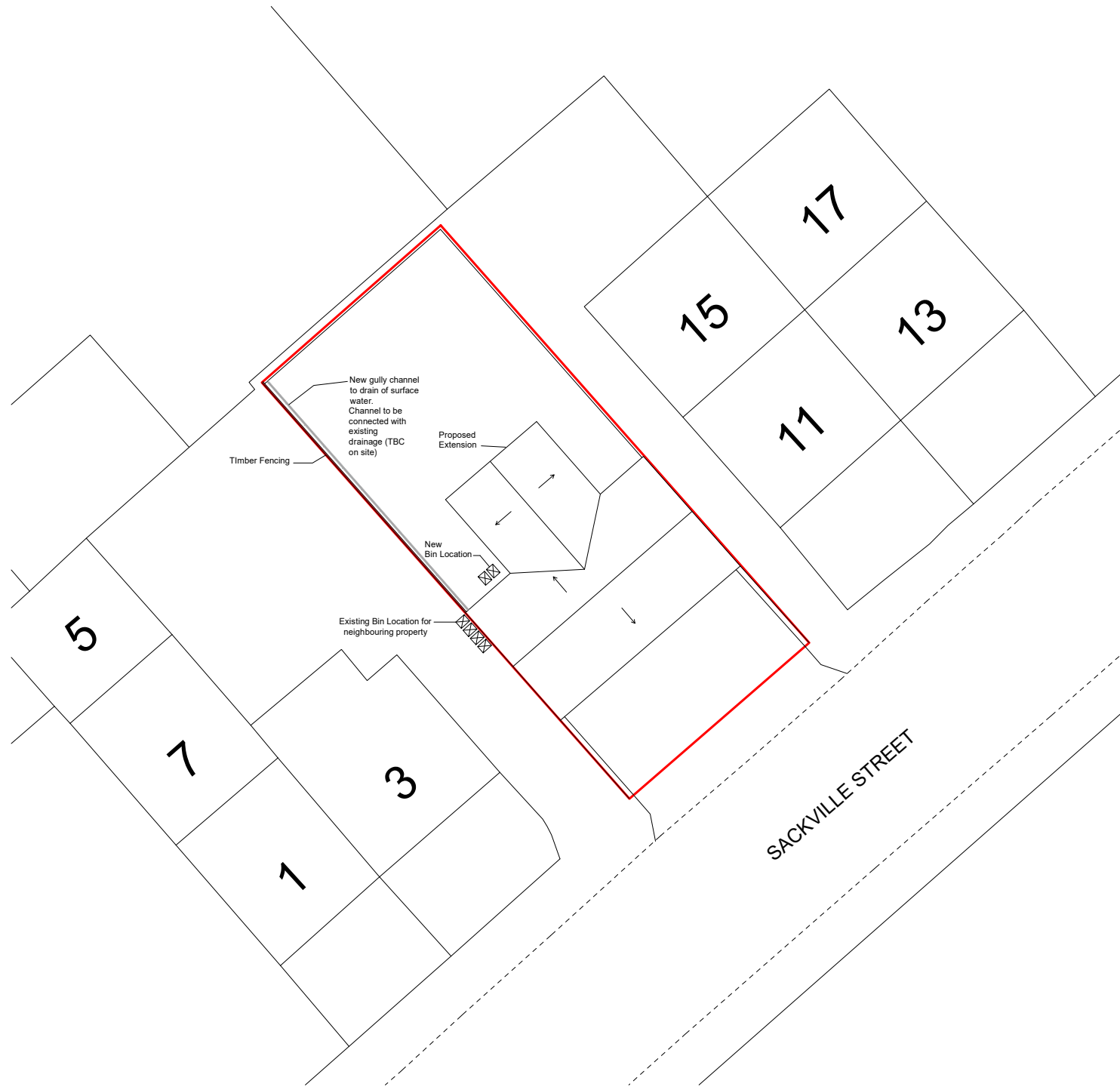
Site Plan Scale 1:100