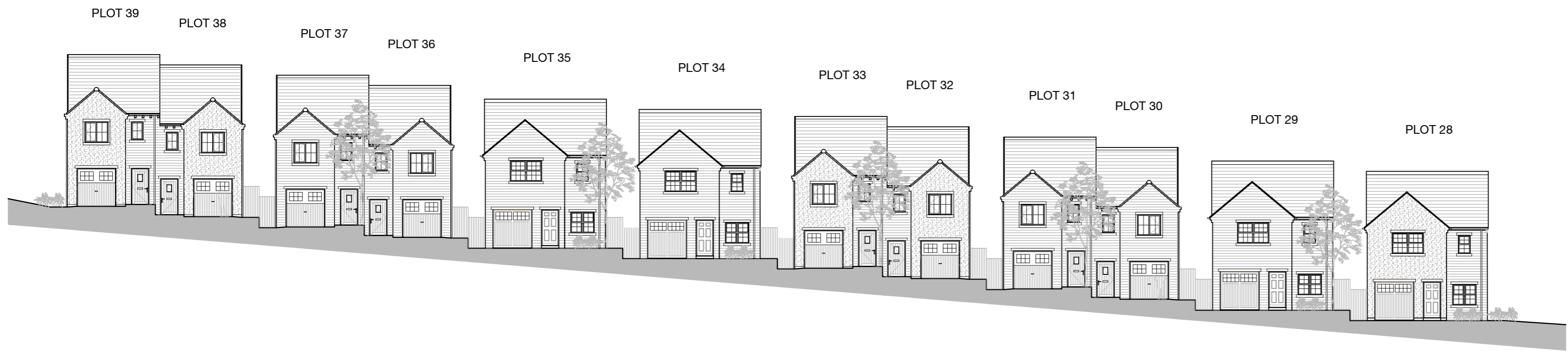
Street Elevation 1