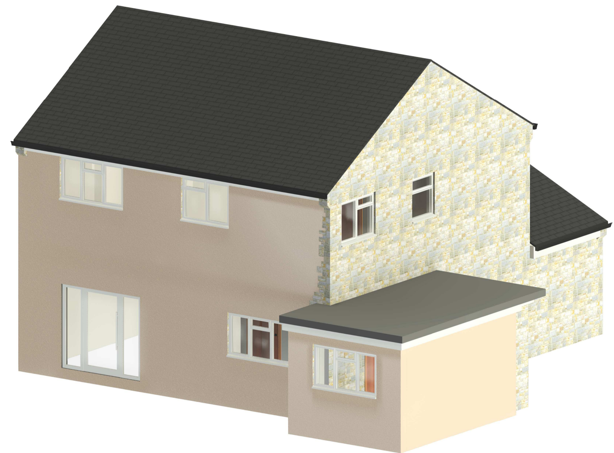
AERIAL PERSPECTIVE TWO