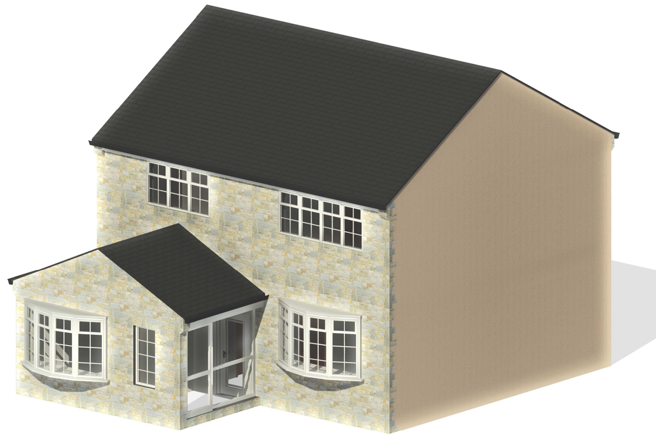
AERIAL PERSPECTIVE ONE