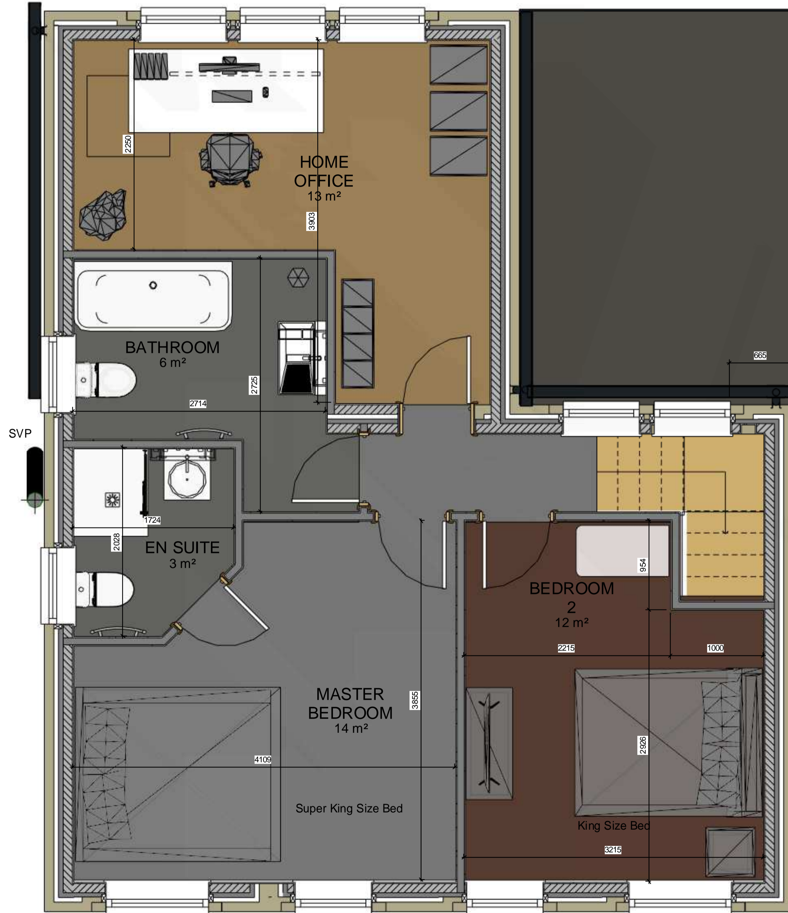
1 FF PRP 1:25