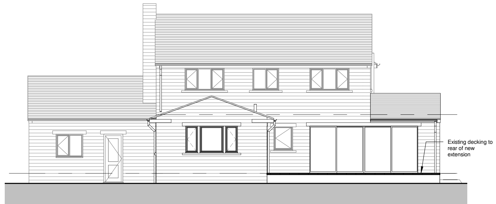
East Proposed 1 : 100