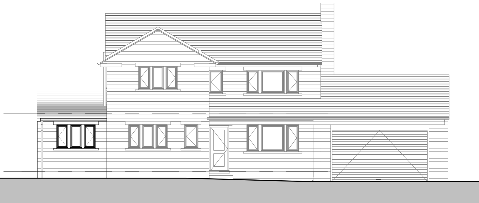
West Proposed 1 : 100