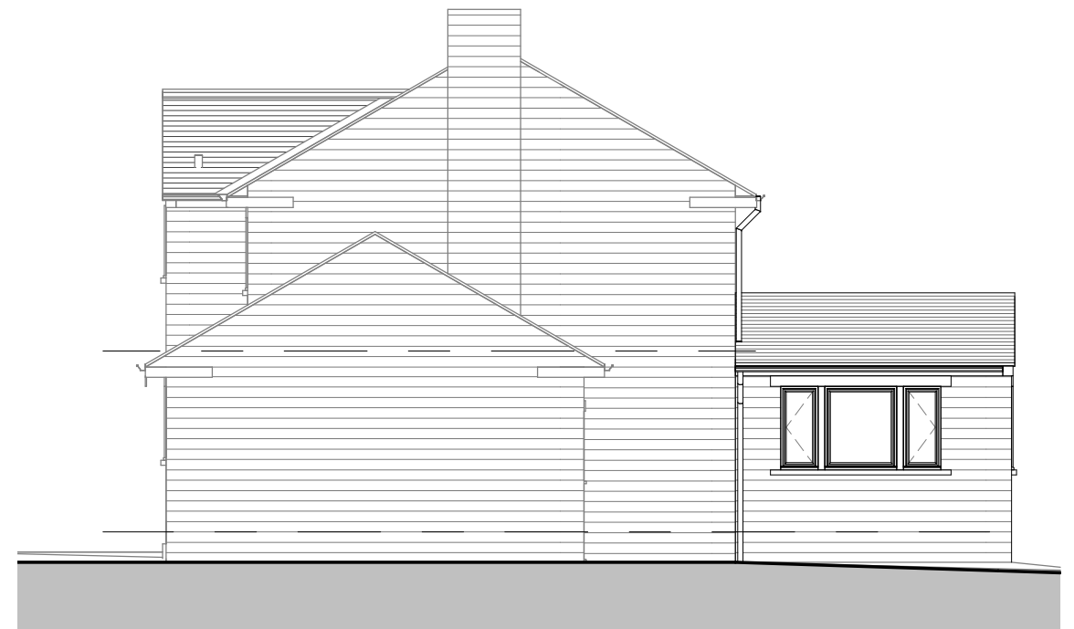
South Proposed 1 : 100