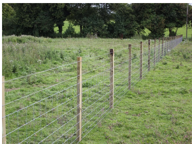
POST AND WIRE FENCE

Arlene McIntosh Landscape Architect 7 September 2020