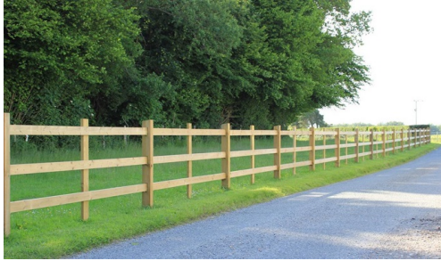
POST AND RAIL FENCE

The images below are taken from Jacksons Fencing to illustrate the design and quality of the products to be specified.