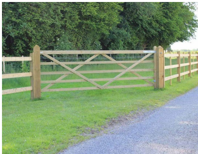
FIVE BAR FIELD GATE 5 METRES WIDE