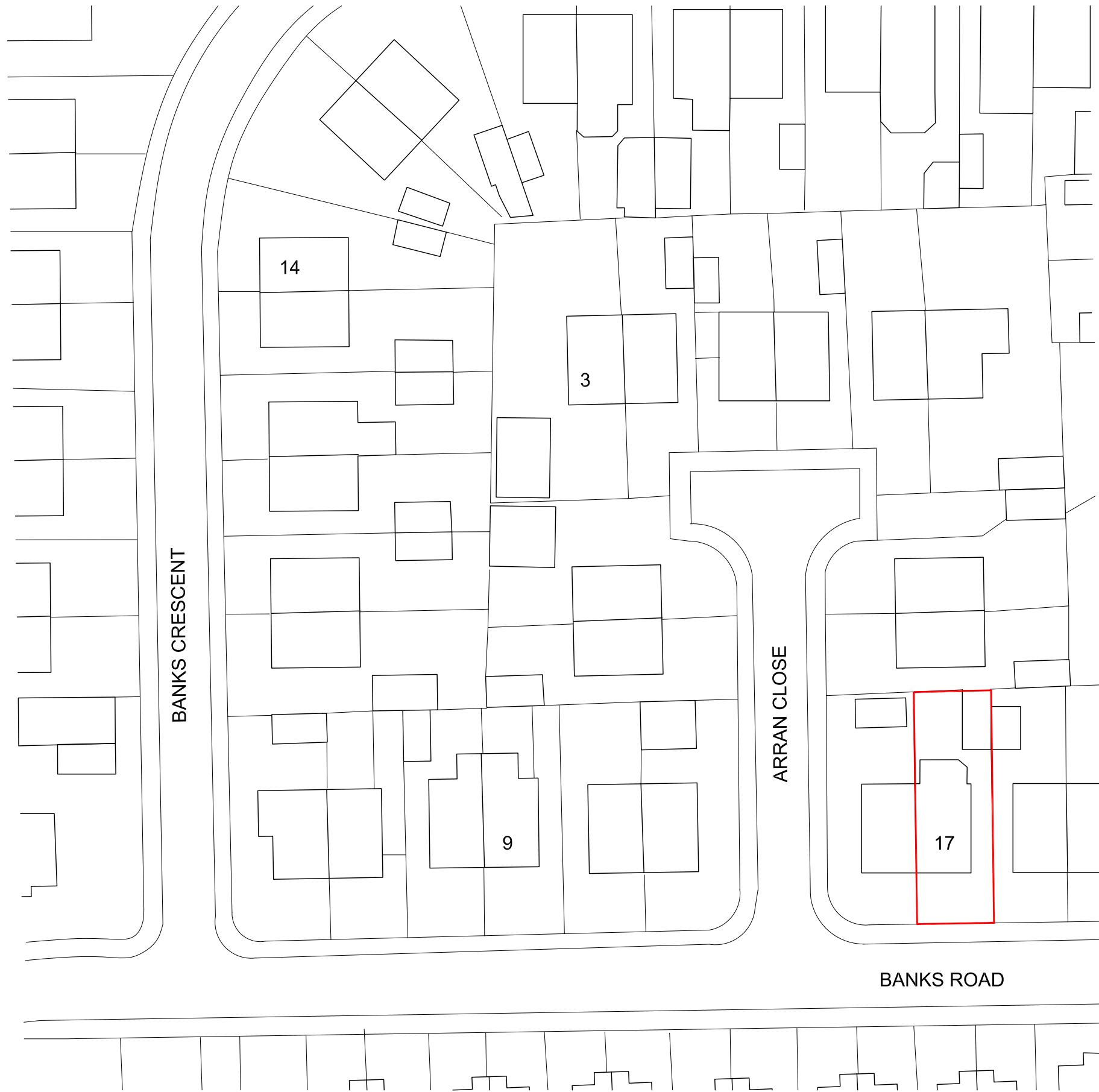
LOCATION PLAN @ 1:500