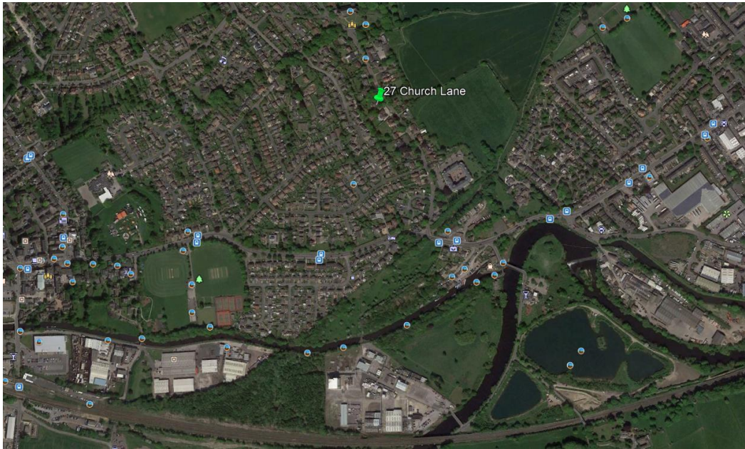
Figure 1: Aerial Location Plan