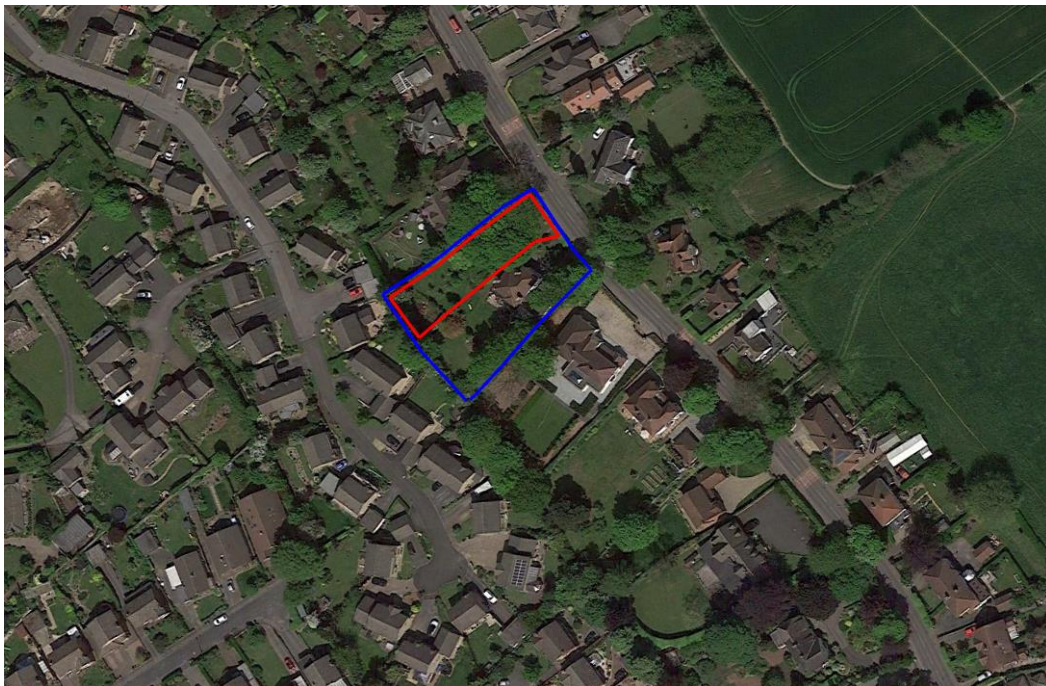
Figure 2: Close-up aerial photo of site