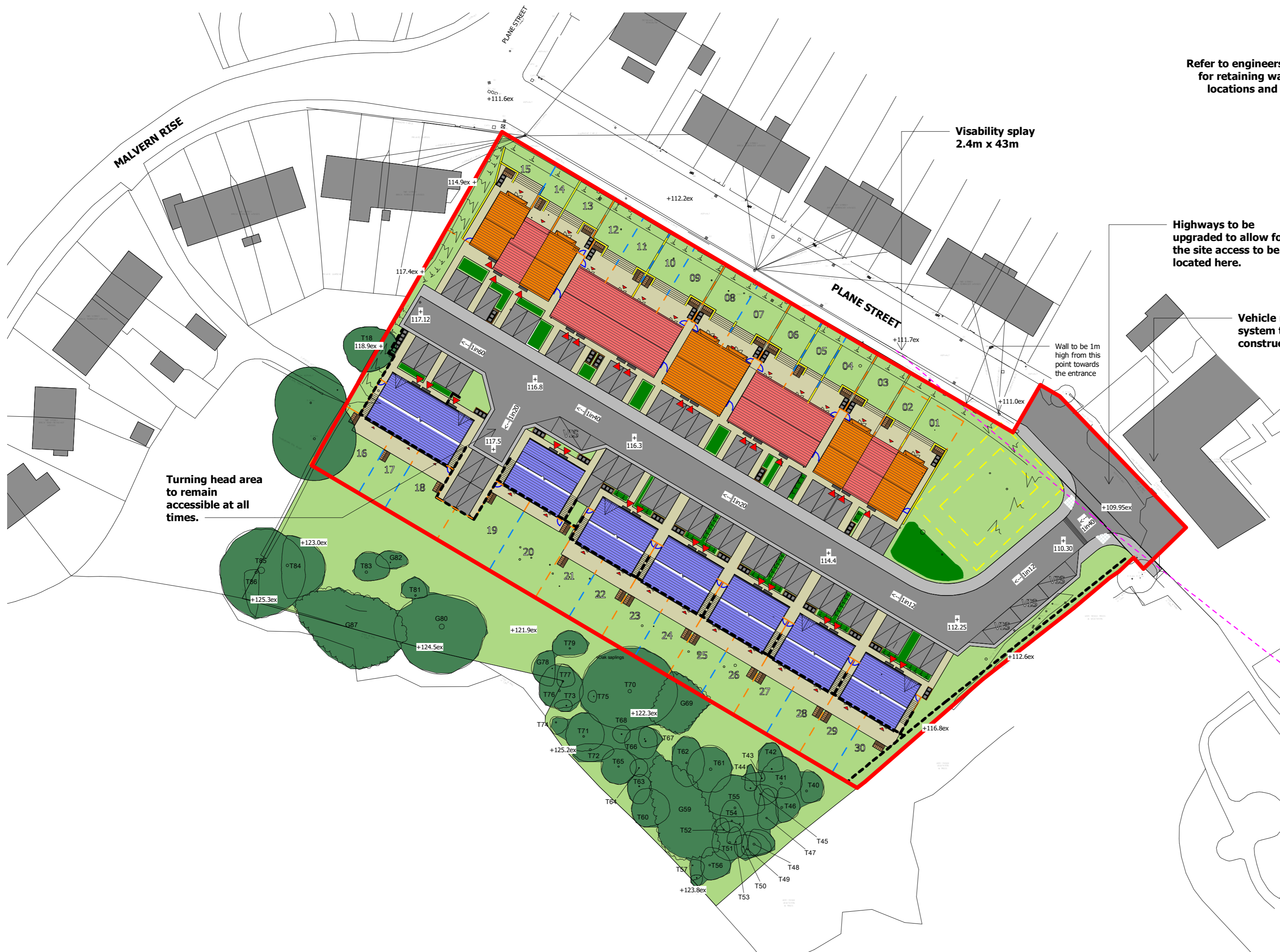
_Site Plan RLB 1 : 500

Refer to engineers information for retaining wall details / locations and Plot FFLs