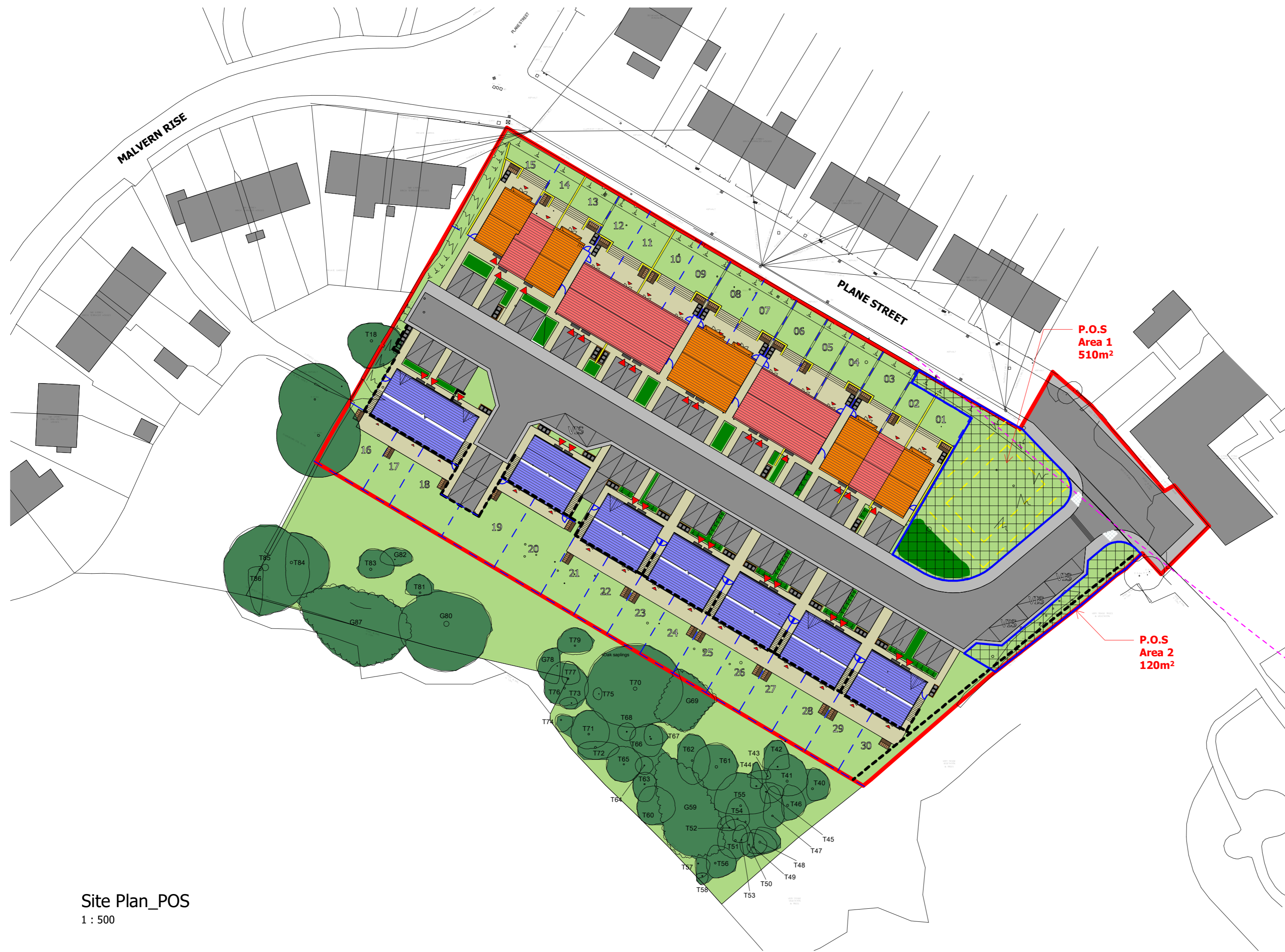
Site Plan_POS 1 : 500