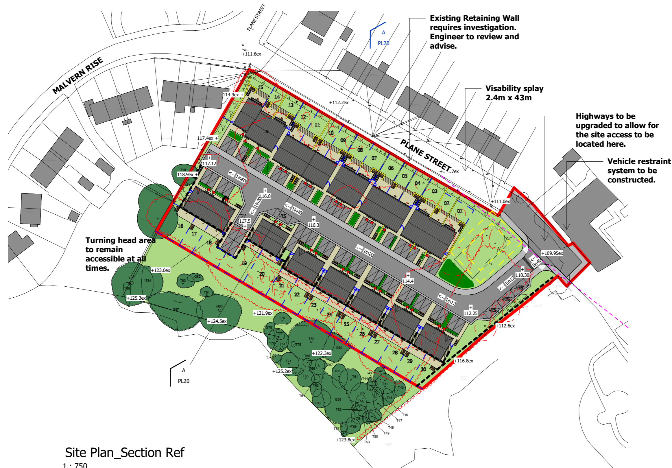
Site Plan_Section Ref 1 : 750