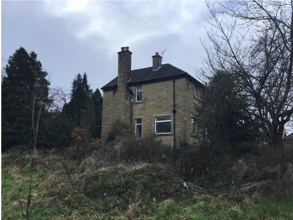
Plate 7: Building 1, viewed from north