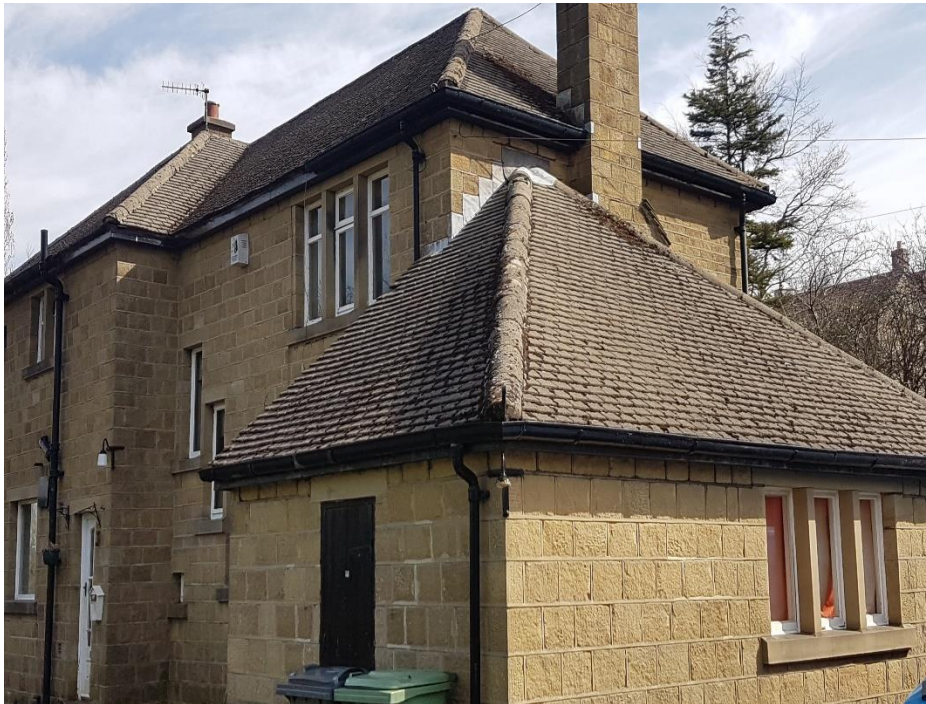
Plate 10: Rear of garage