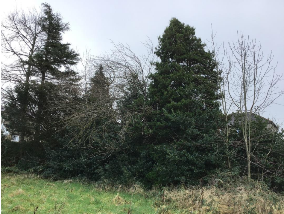
Plate 3. Scattered trees