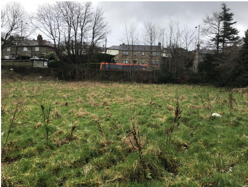
Plate 2. Improved grassland