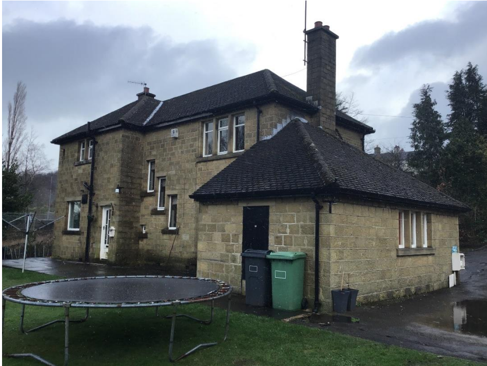
Plate 5: Building 1, viewed from southwest