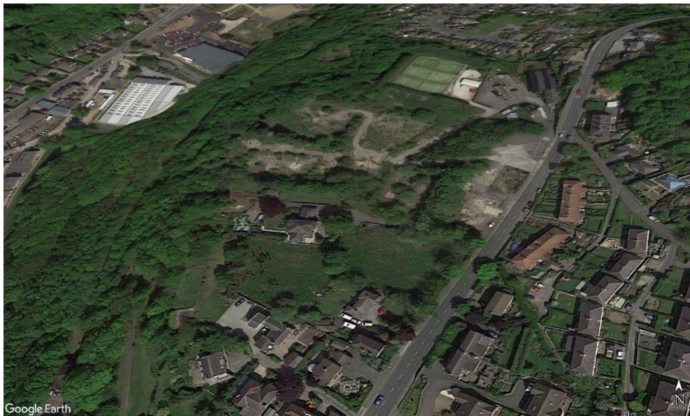
Figure 1: Aerial Imagery of Site and Surrounding Area (Google Earth Pro, 2020)

The site consists of a residential property with its associated garden, parking areas and a field. The site is located at grid reference SE 14809 09173 and is accessed off the west of New Mill Road (A635) in Holmfirth. The site is bordered by a residential property and its access drive to the north, by New Mill Road to the east, residential properties to the south and a garden to the west, approximately 30 m beyond which is a woodland. Figure 1, below, shows aerial imagery of the site and the surrounding area.