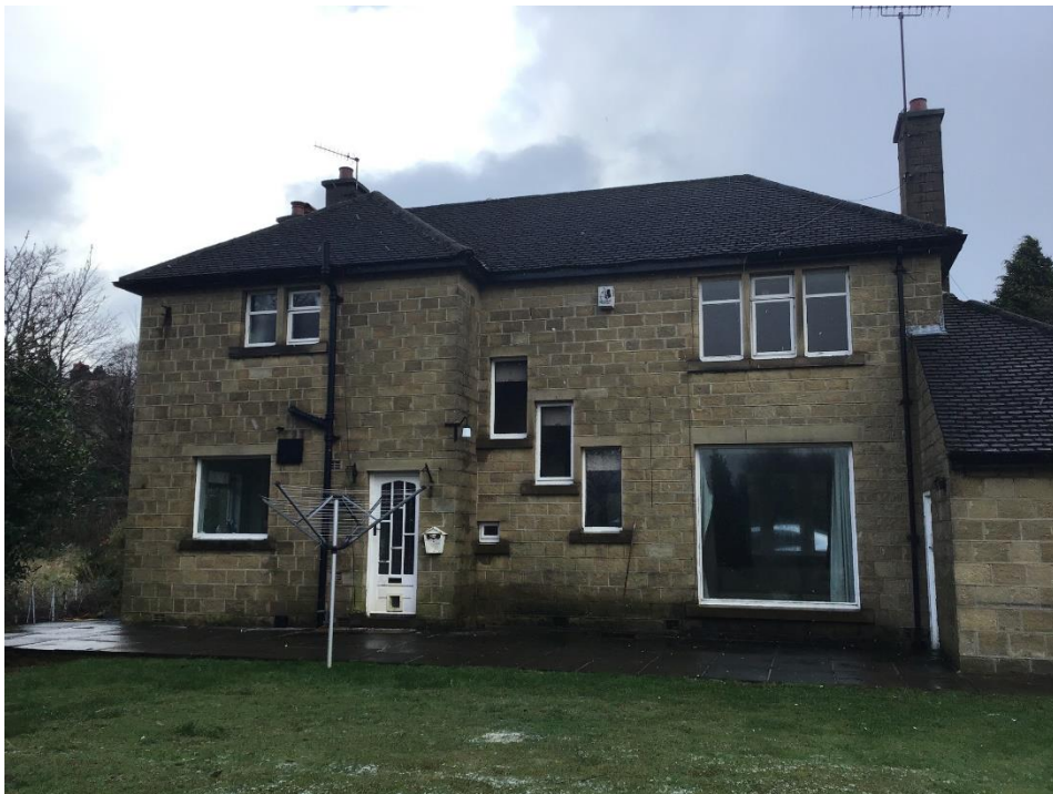
Plate 6: Building 1, viewed from west