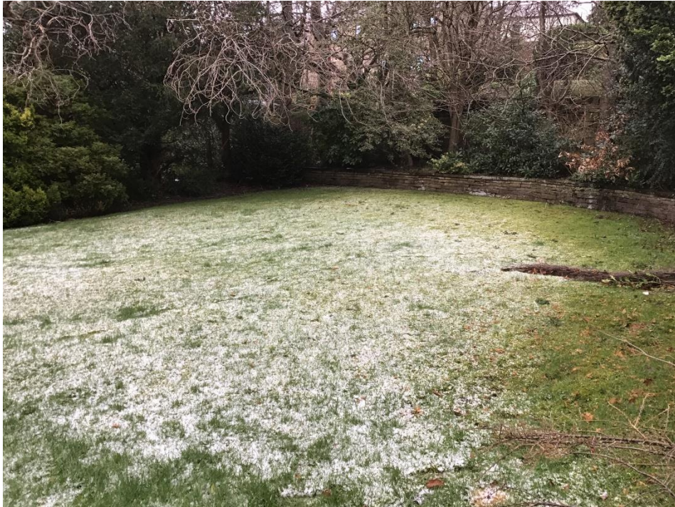
Plate 1. Amenity grassland