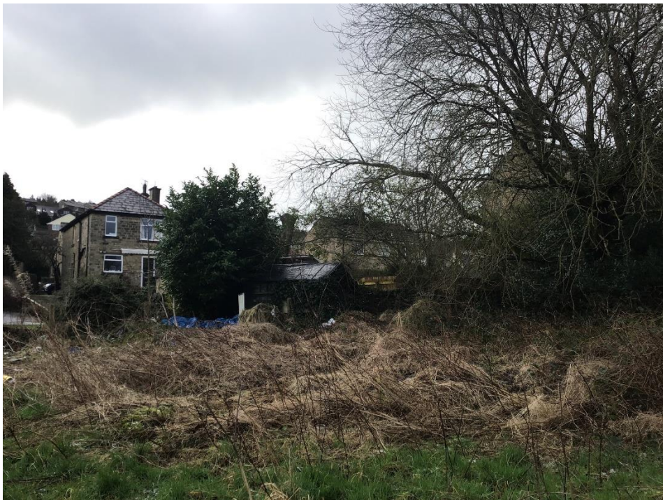
Plate 4. Scattered scrub