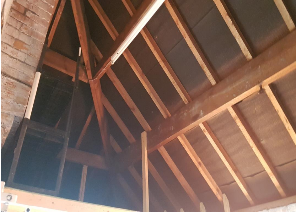
Plate 9: Interior of garage