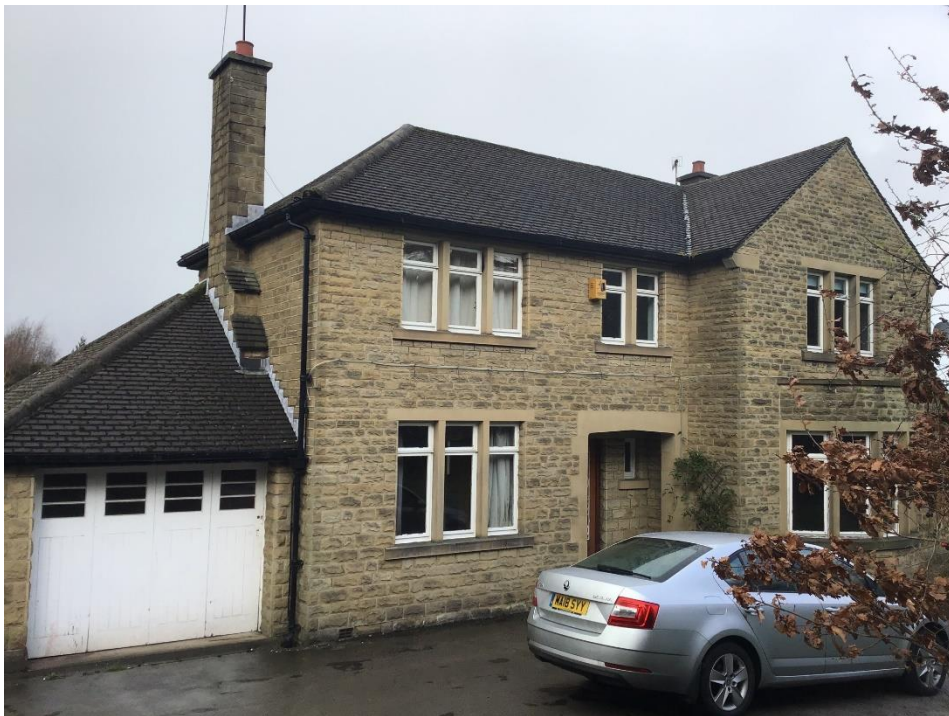
Plate 8: Building 1, viewed from east