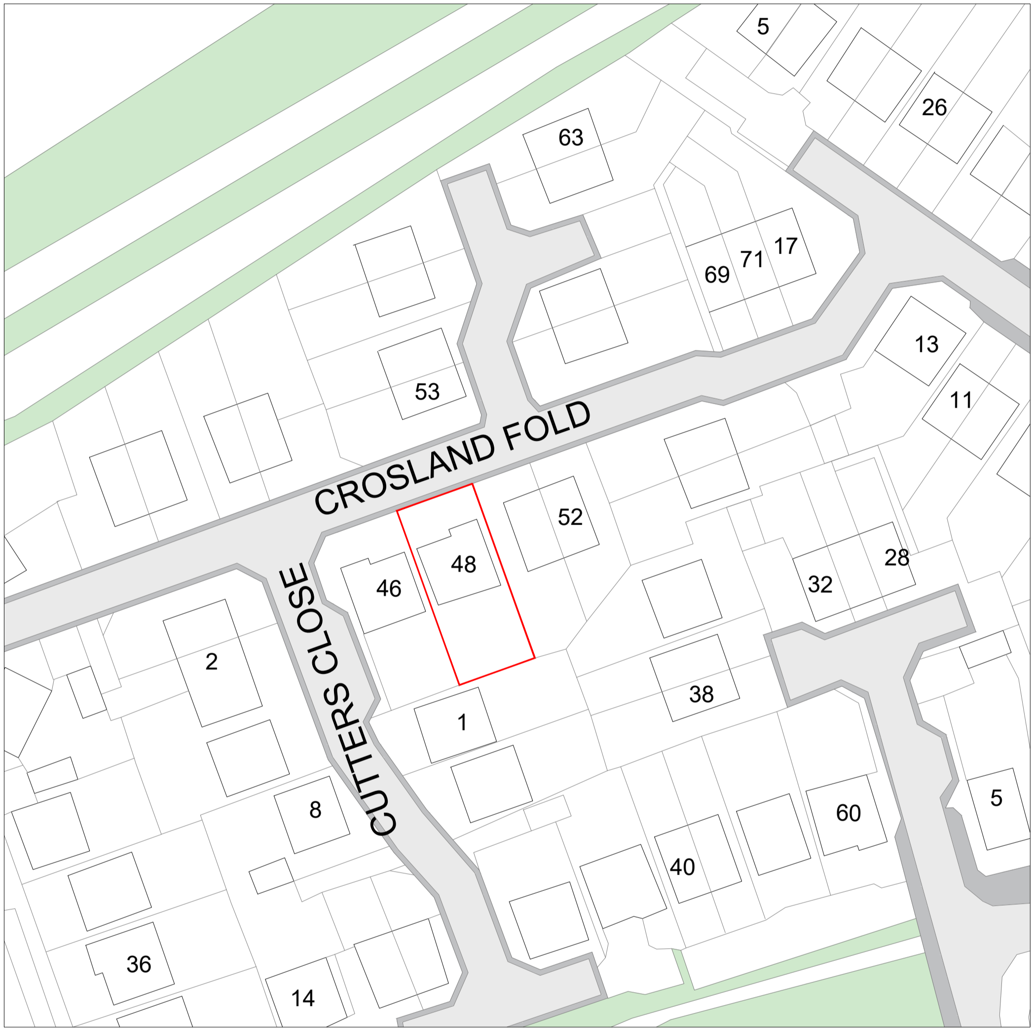
LOCATION PLAN - 1:500