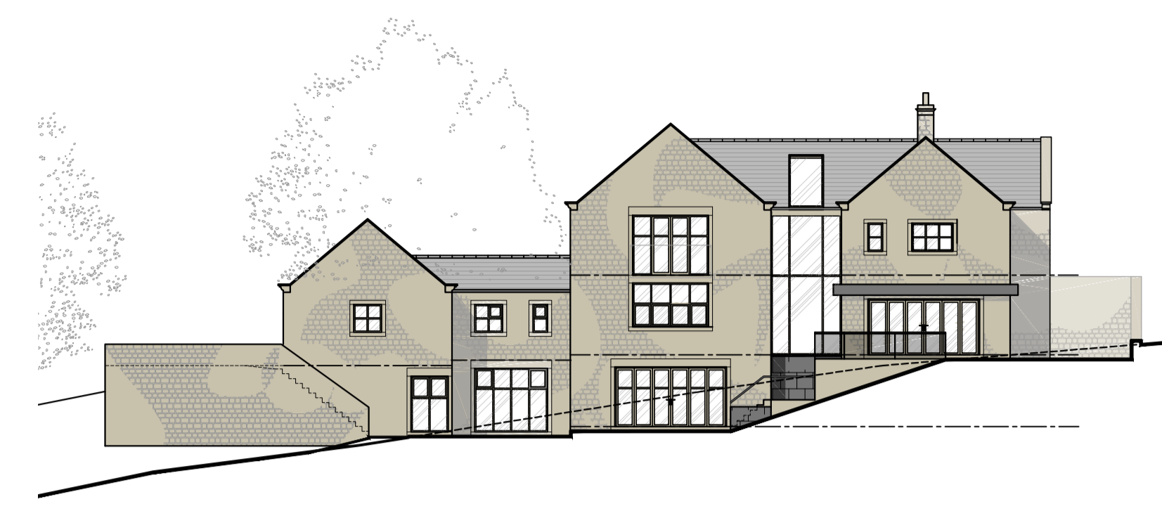
S E C T I O N A