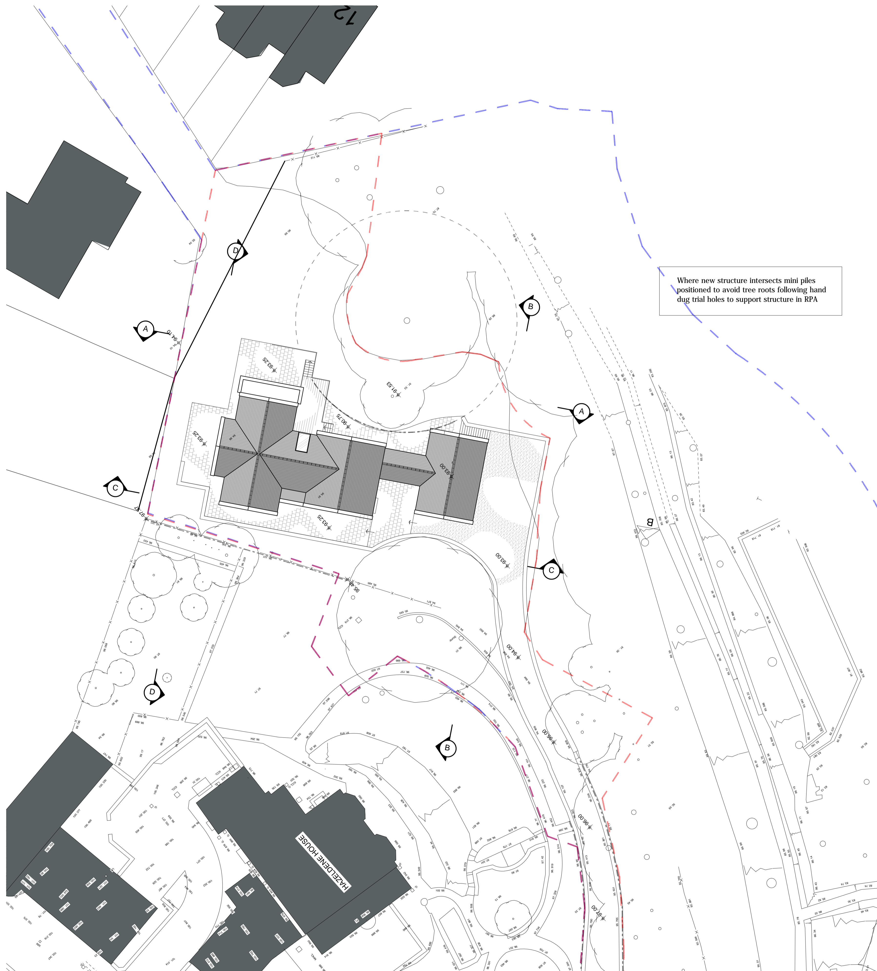
S I T E P L A N