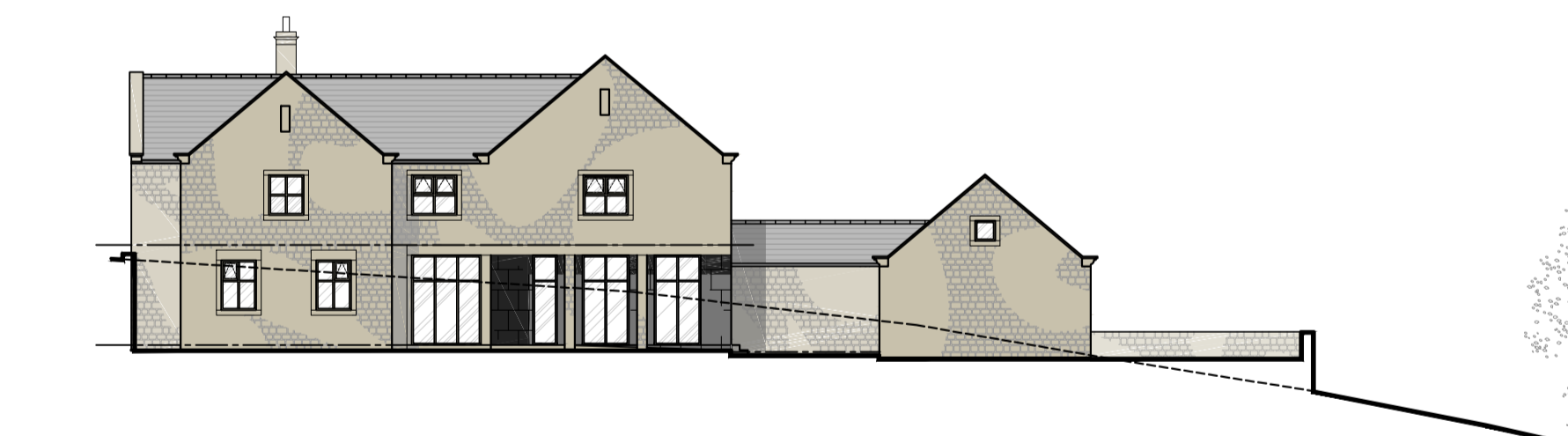
S E C T I O N C