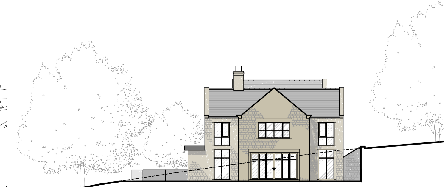
S E C T I O N D