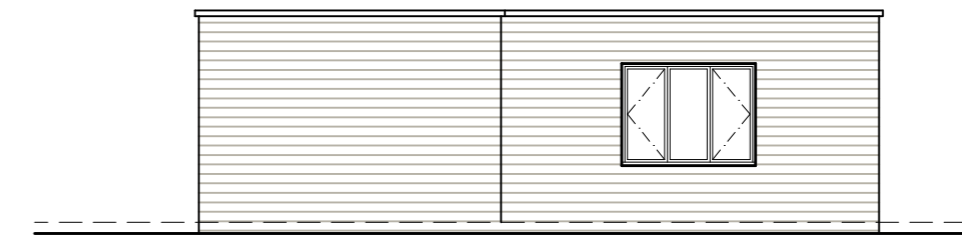
PROPOSED ELEVATION ---D SCALE 1:100