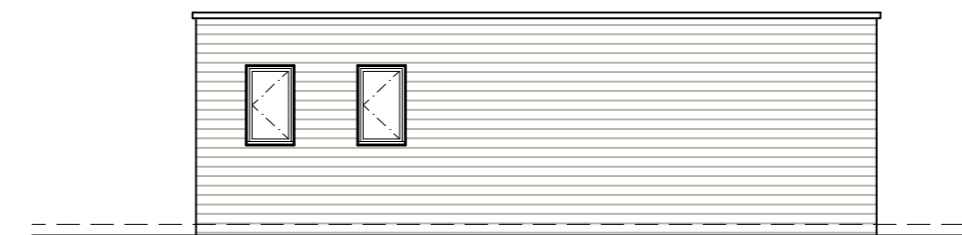
PROPOSED ELEVATION --- C SCALE 1:100