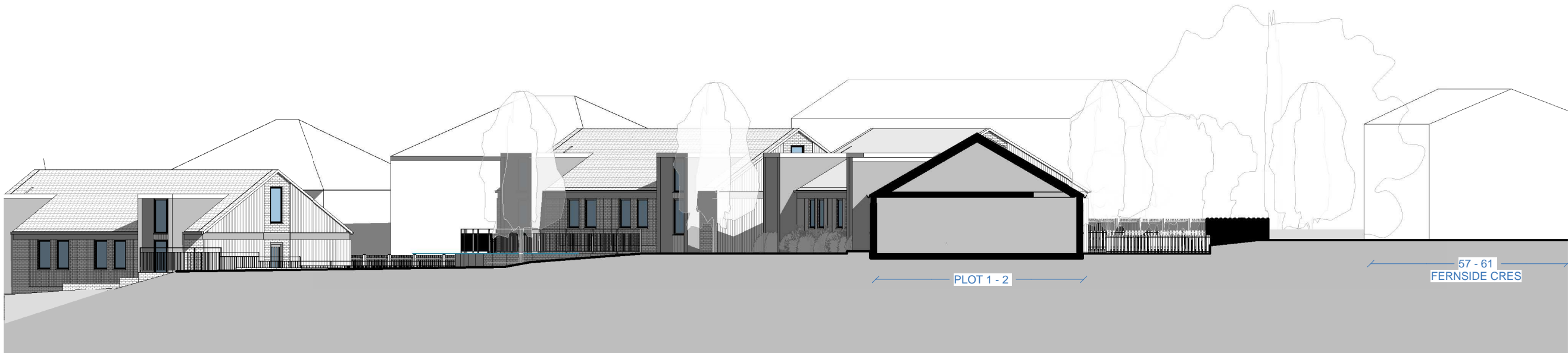
2 Long Section CC 1 : 100