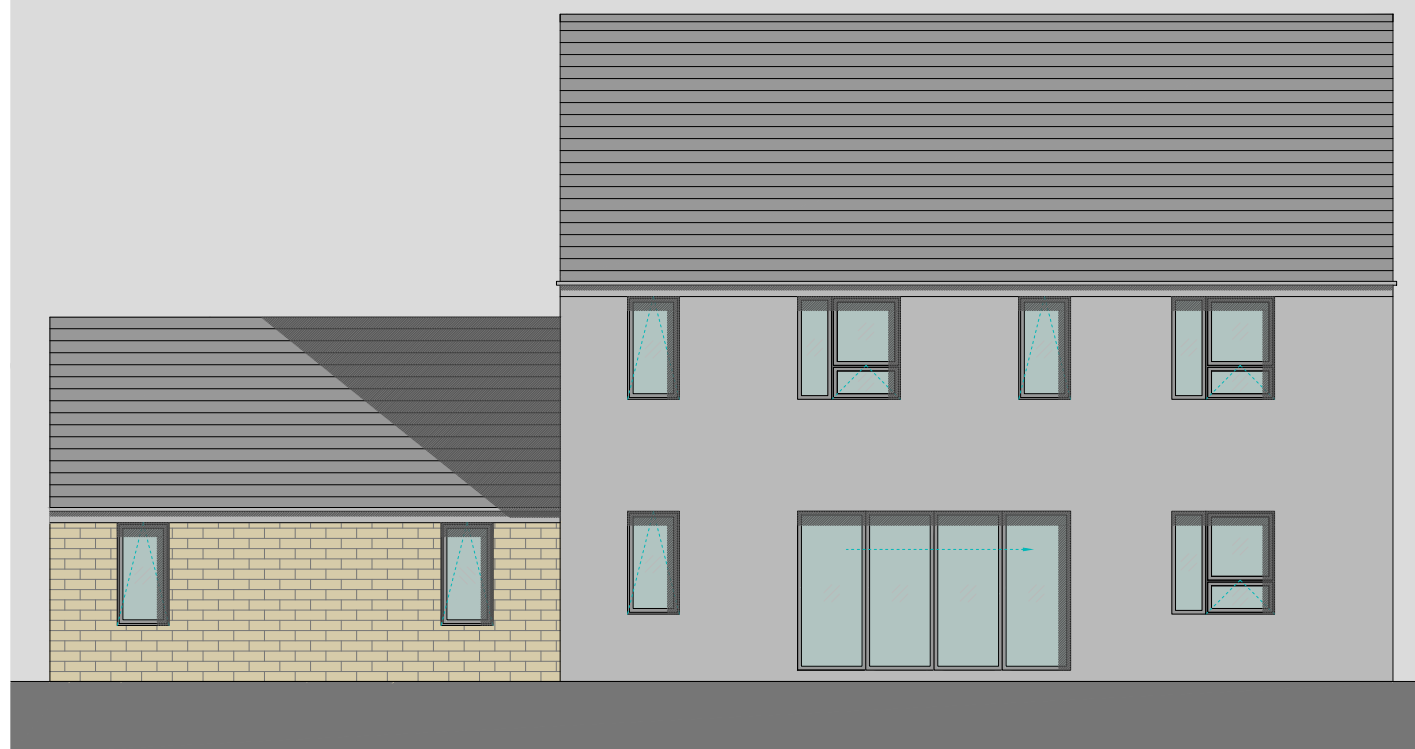
REAR ELEVATION SCALE 1:100 @ A3