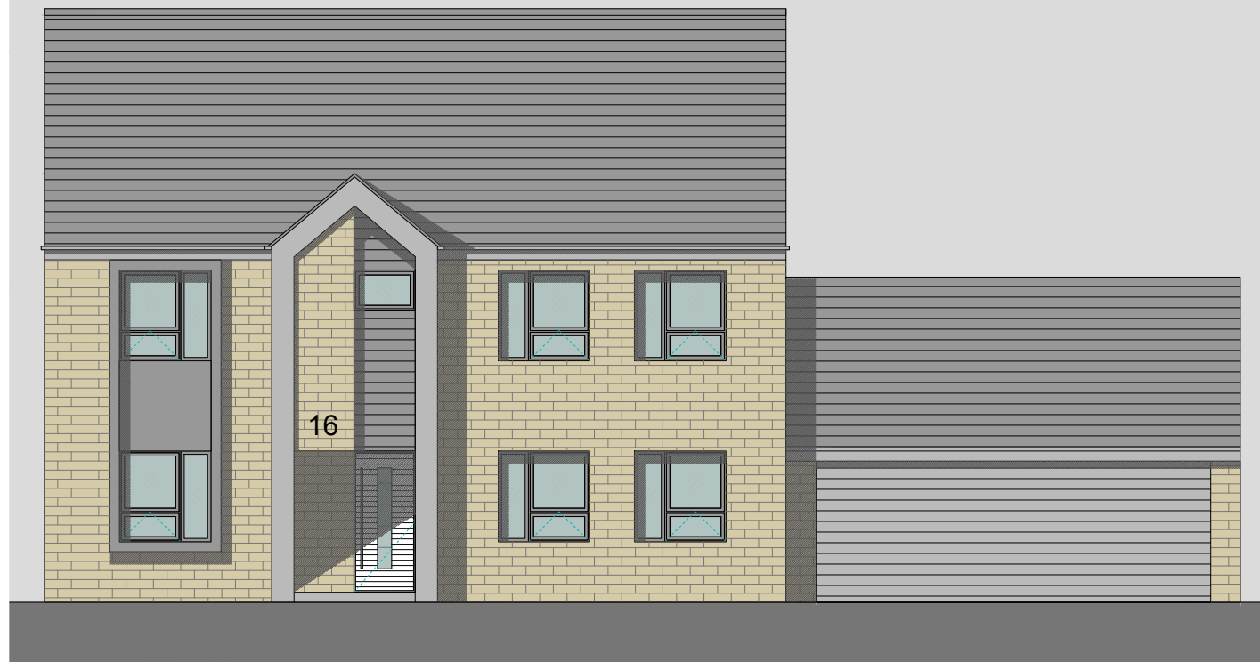
FRONT ELEVATION SCALE 1:100 @ A3