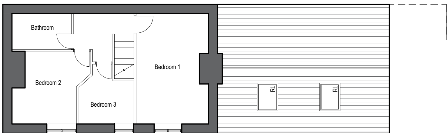
FIRST FLOOR PLAN Proposed

Notes: Unless indicated, this drawing is for information only. Do not scale, use figured dimensions only. All dimensions to be checked on site