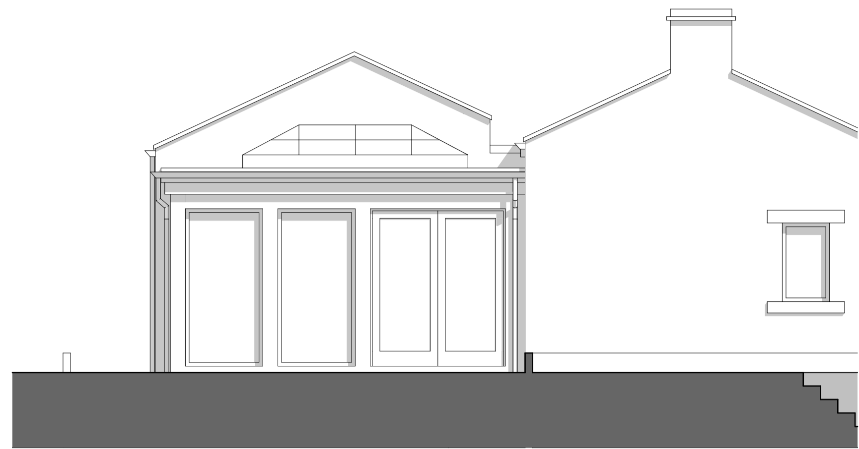
North East Elevation 1:50