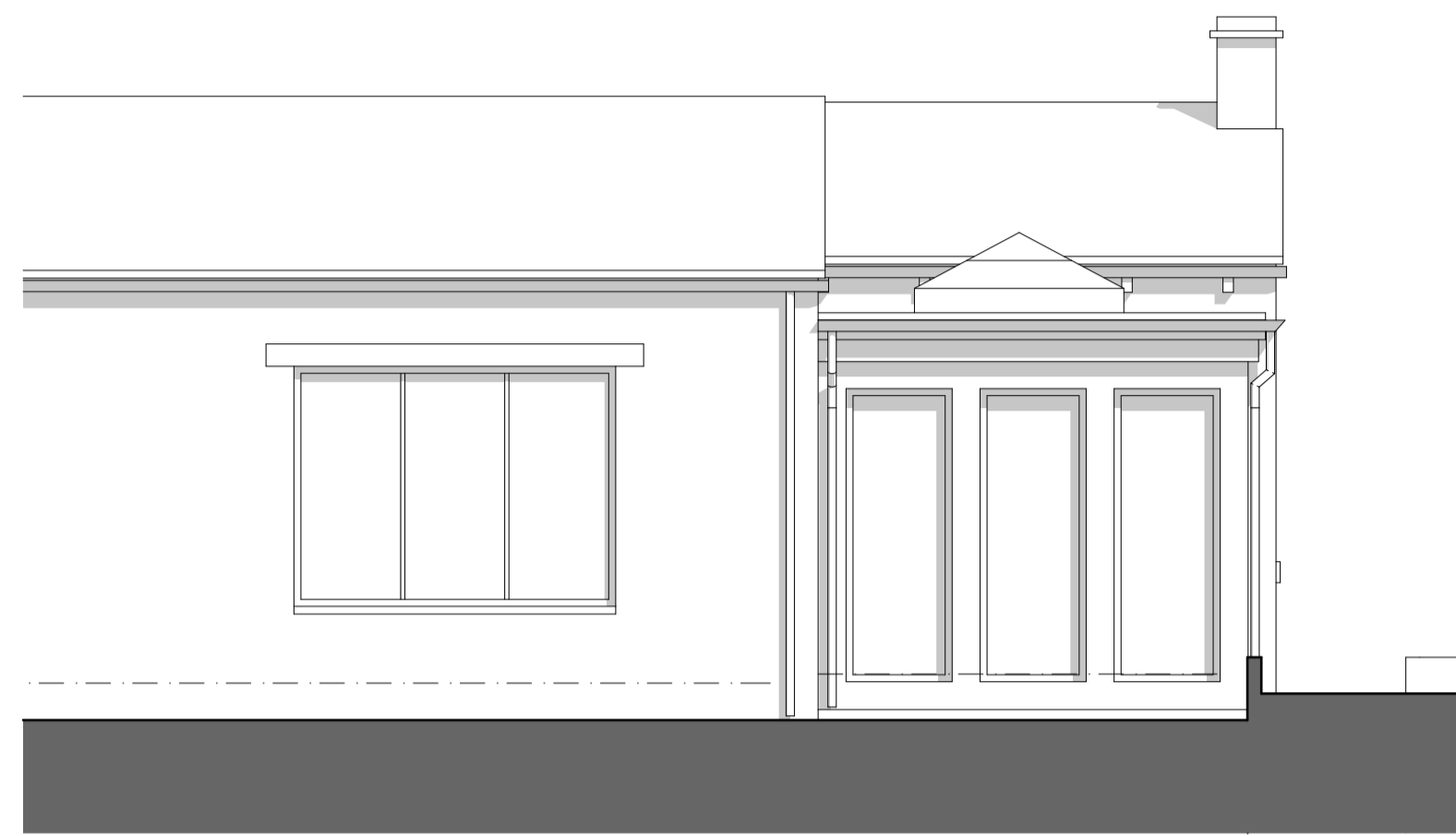
South East Elevation 1:50