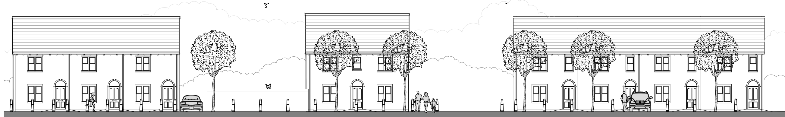
PLOTS 10-12 2B HOUSE