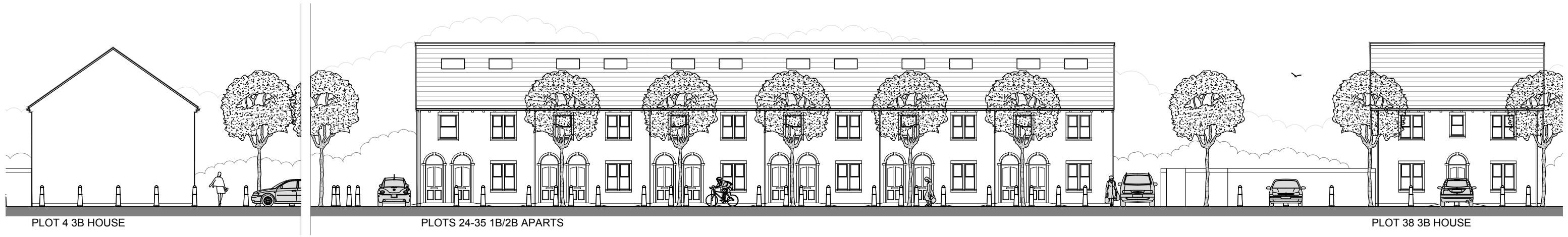
PLOT 4 3B HOUSE