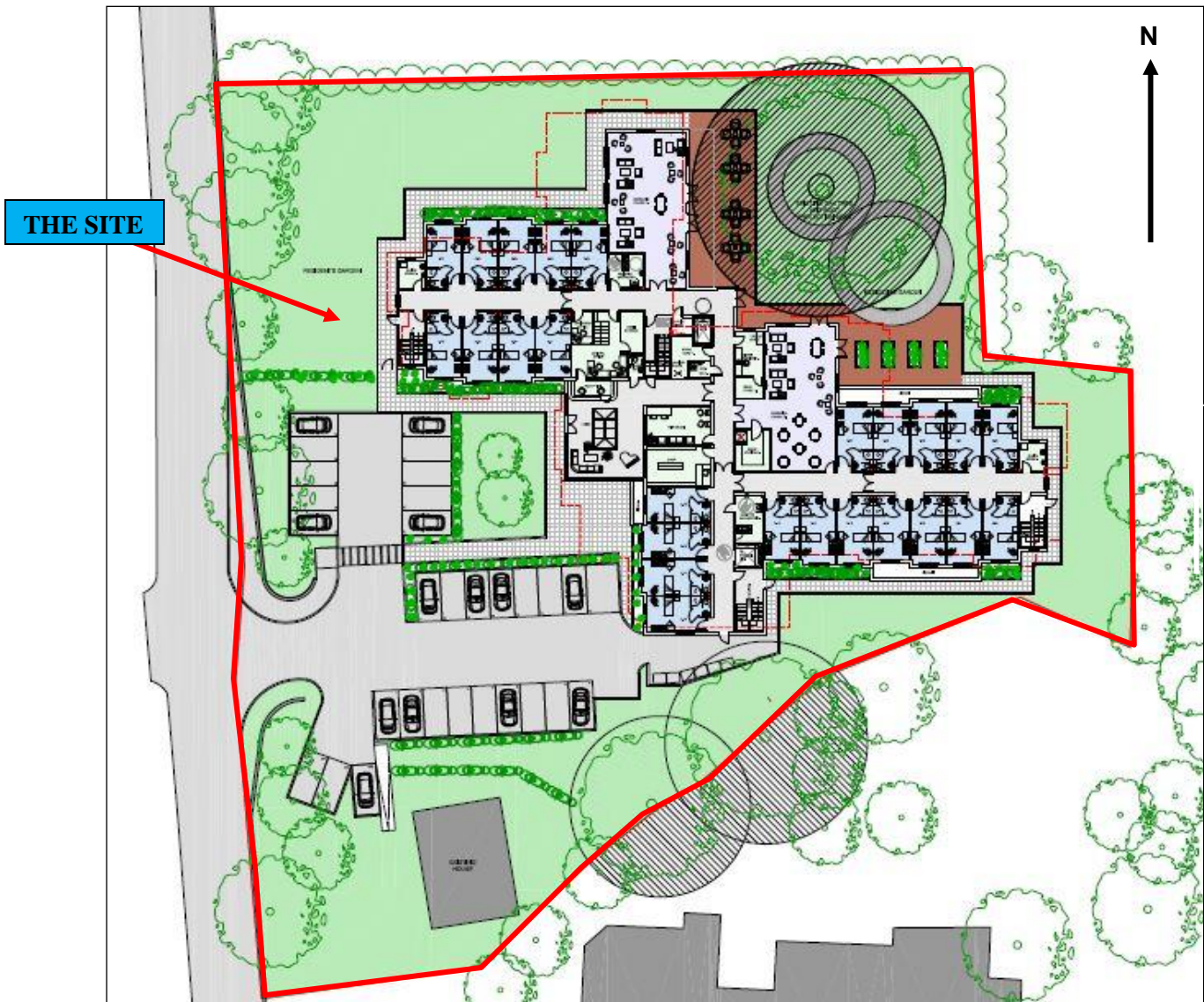
Figure 2: Development Layout Plan

See Figure 2 below for the proposed development layout plan provided by the client with red dashed outline highlighting the previous building footprint prior to demolition.