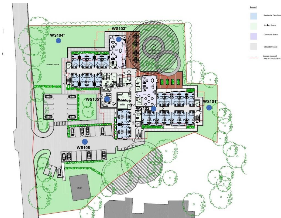
Figure 3: Sampling Location Plan

The sampling locations are illustrated in Figure 3 (below) and the installations are detailed in Table 3.2.1 overleaf.