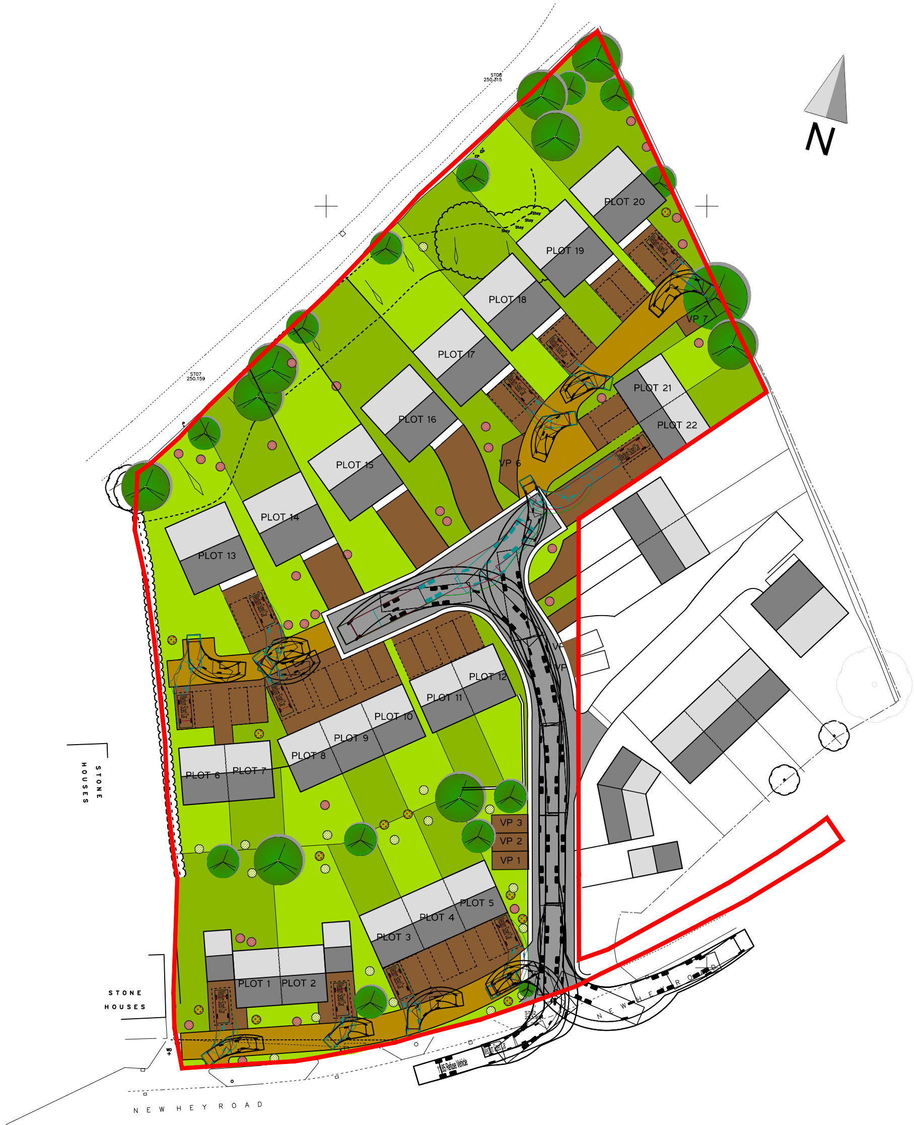
INDICATIVE SITE PLAN

Only figured dimensions should be used. Scaled dimensions should be checked with the Architect. This drawing together with the design, is the property and copyright of the Architect and must not be reproduced without written permission