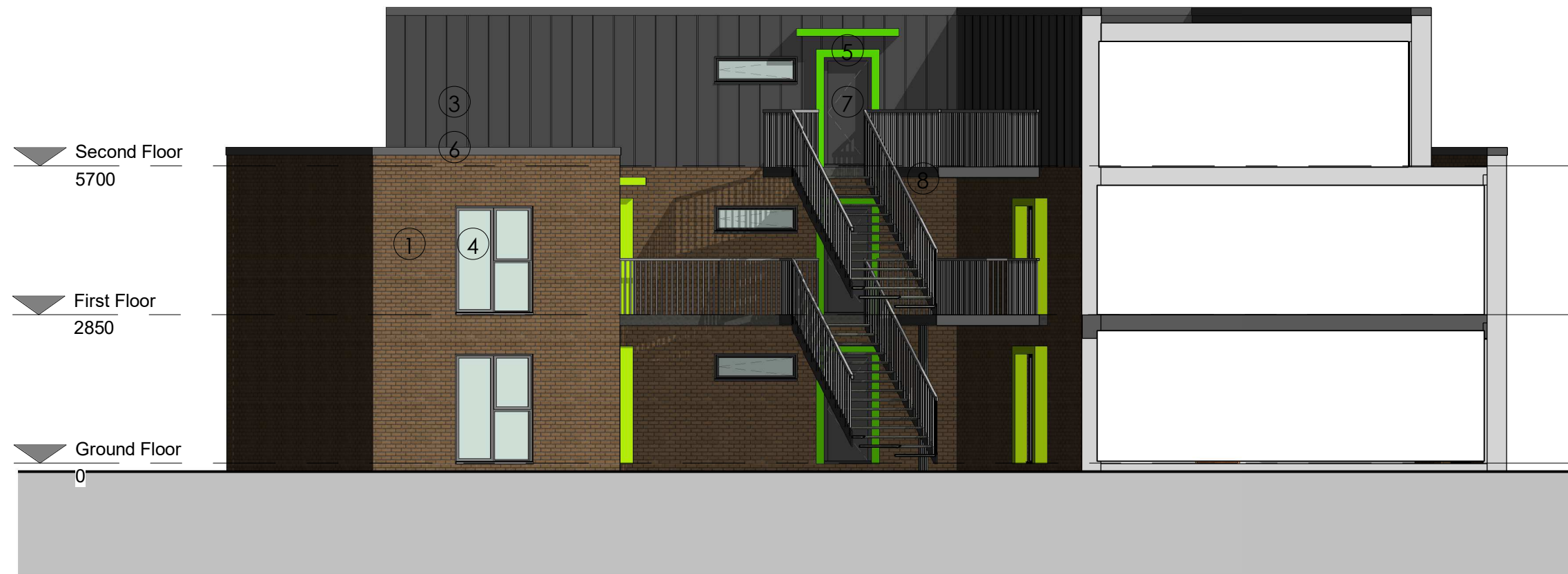
Courtyard Elevation North