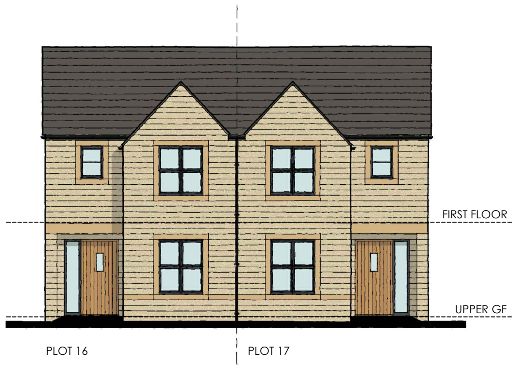
PLOT 16 FRONT ELEVATION