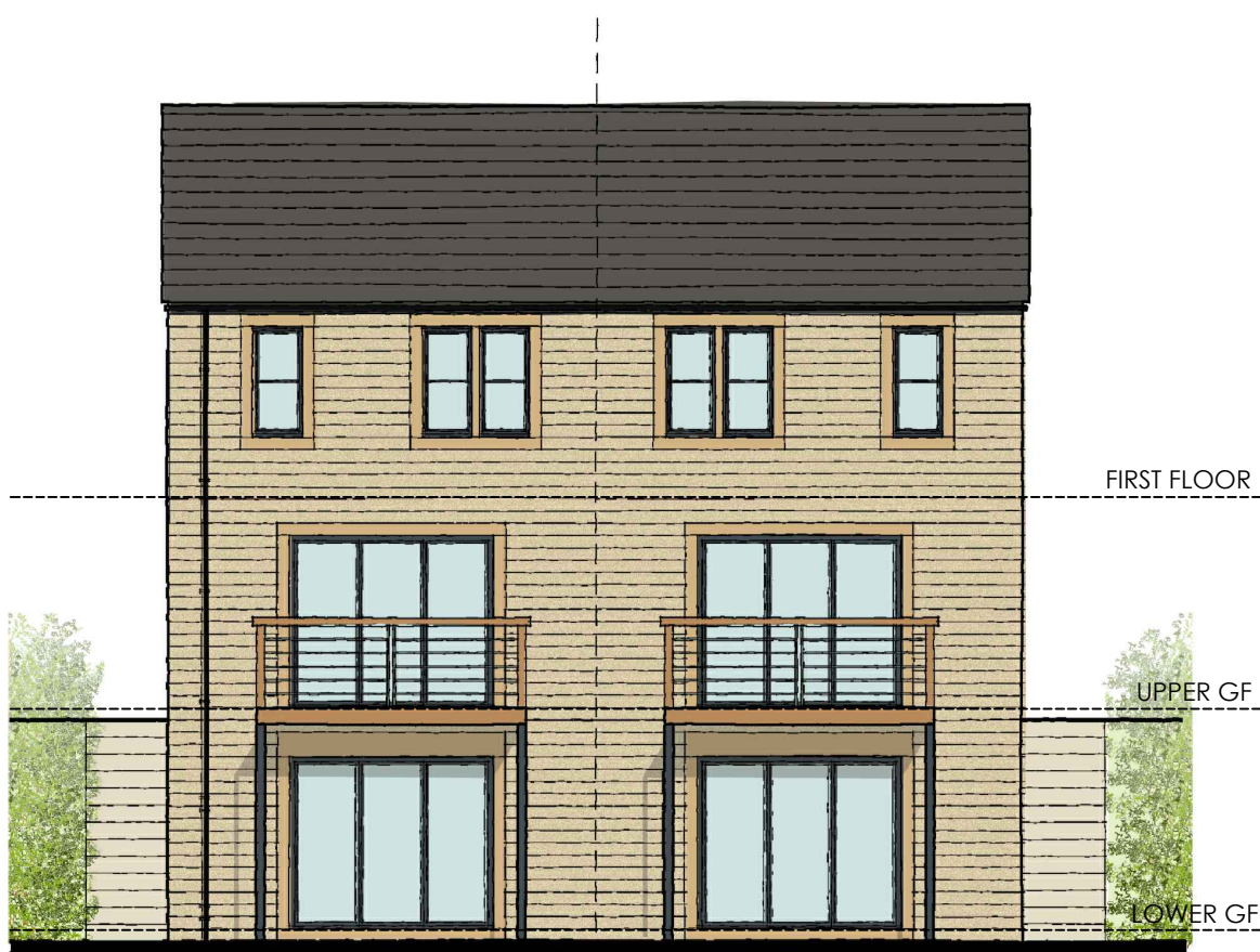
PLOT 17 REAR ELEVATION