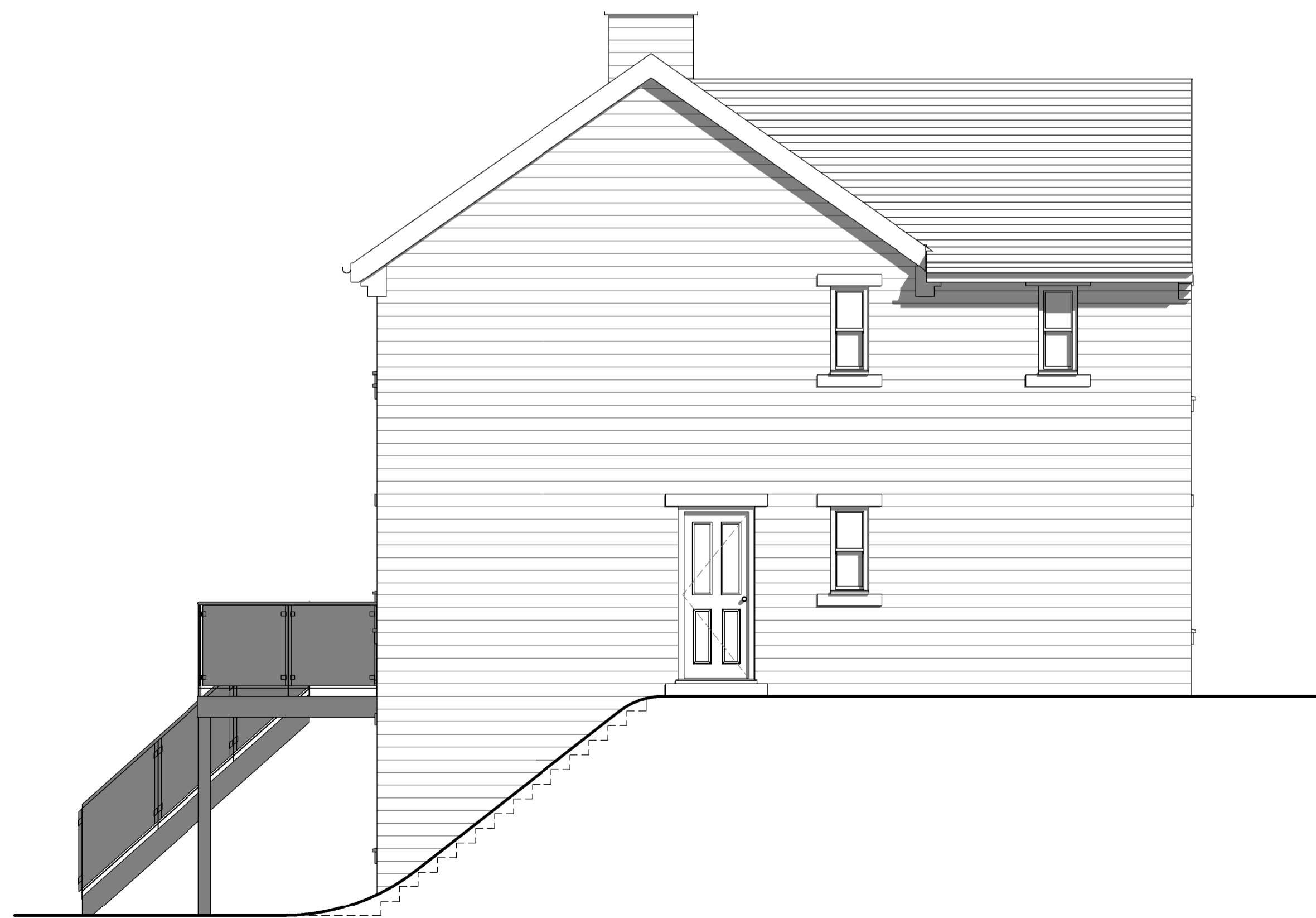
North West Elevation 1 : 50