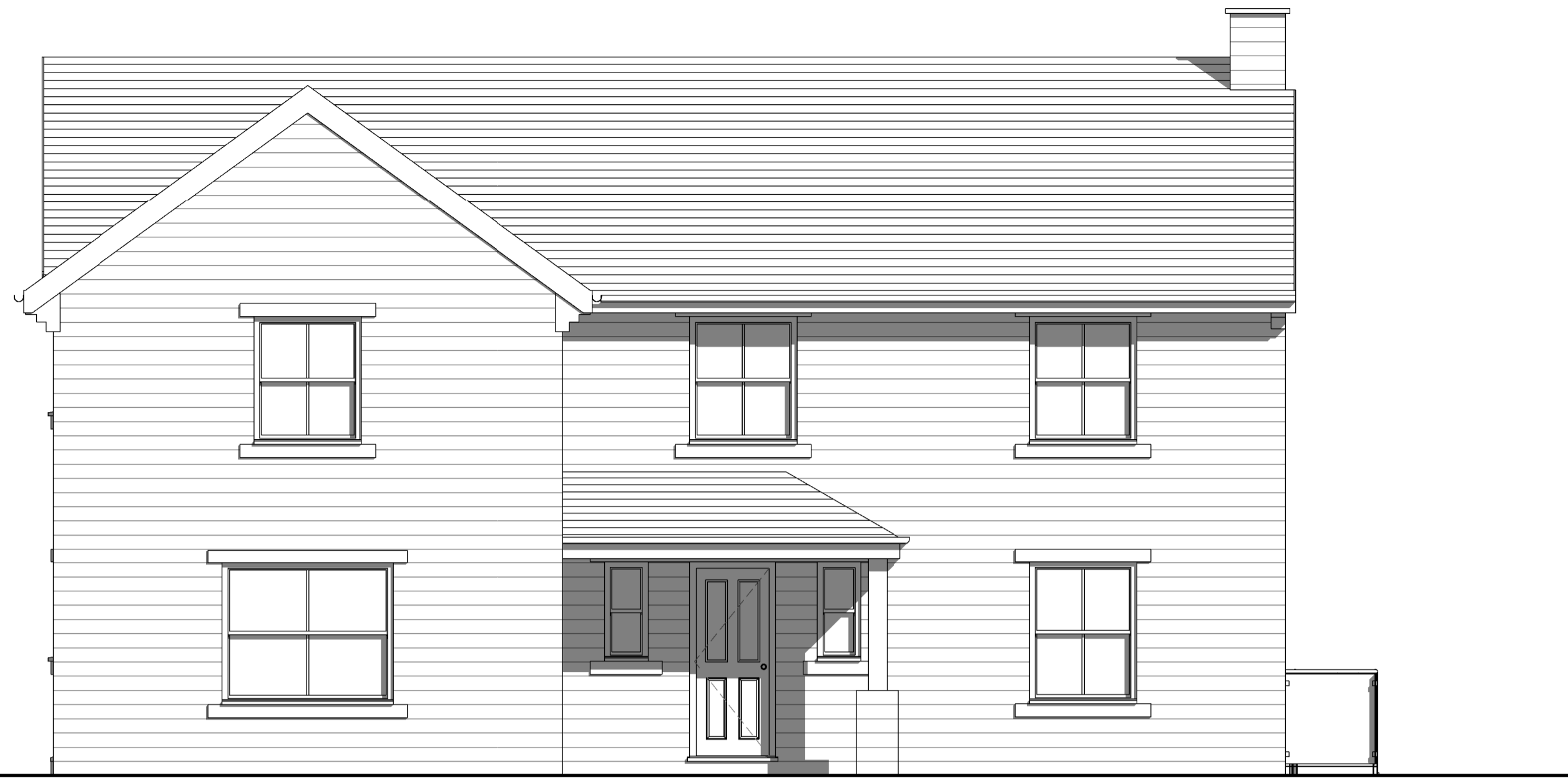
South West Elevation 1 : 50