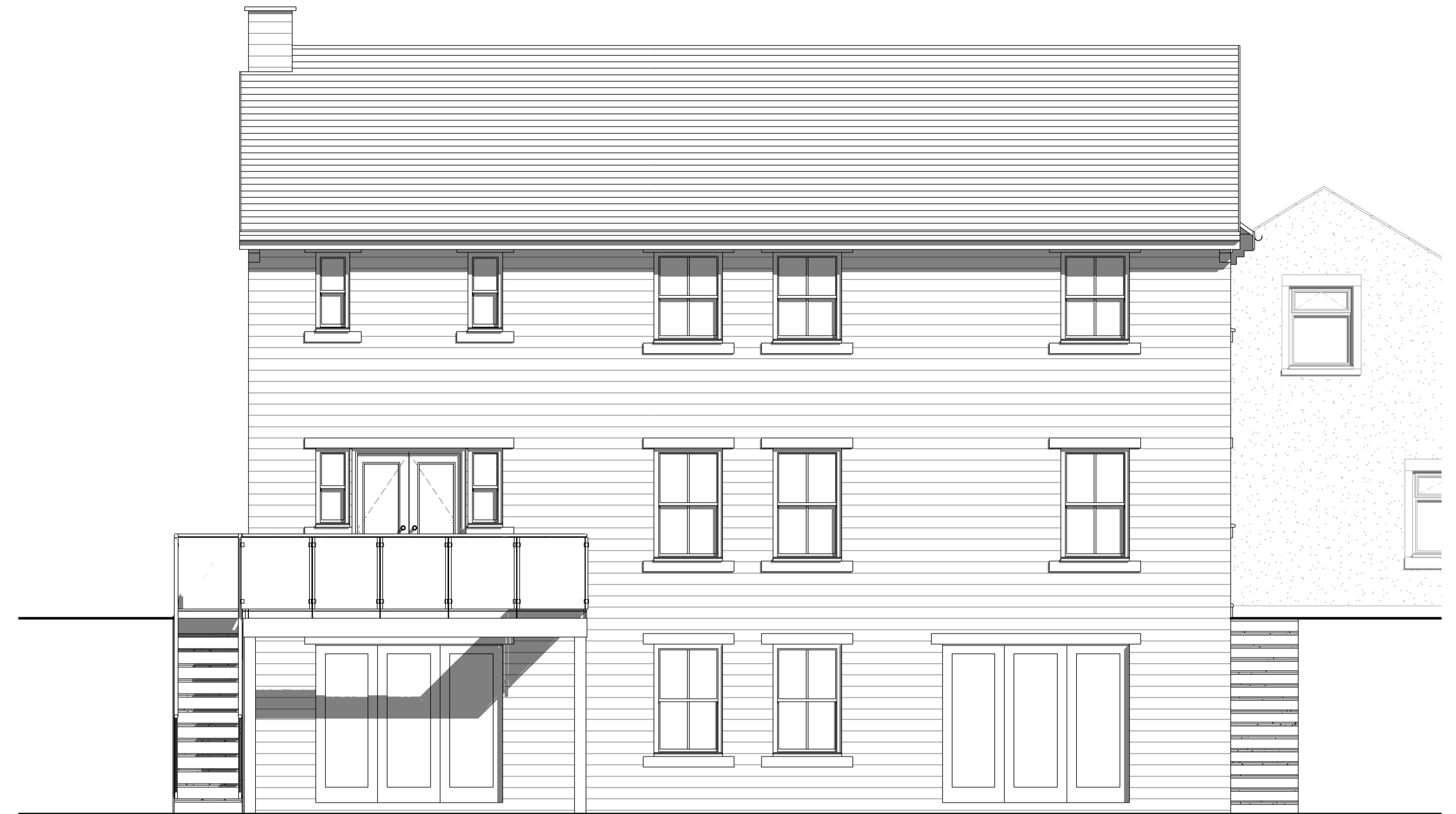
North East Elevation 1 : 50