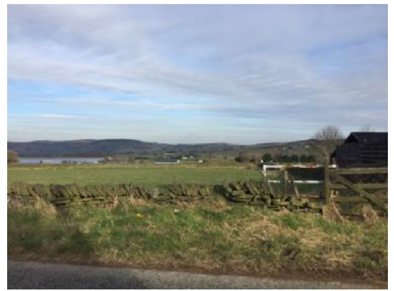
Fig. 1 Looking easterly across the site.