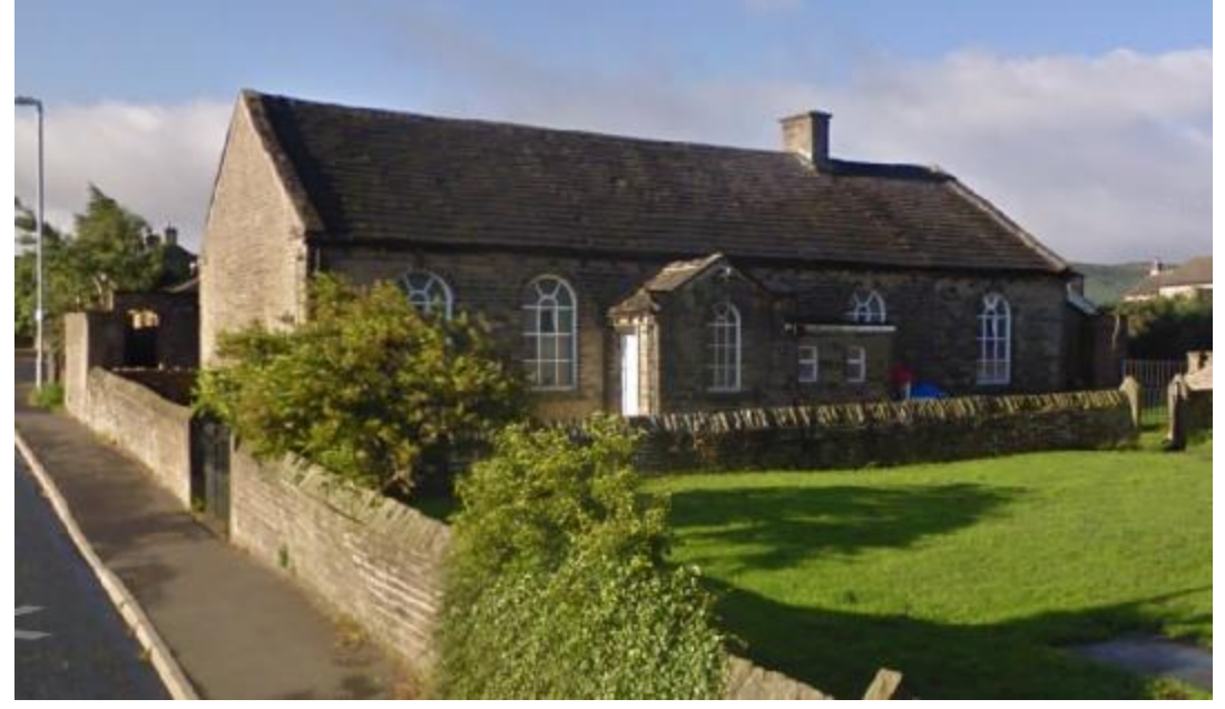
Hade Edge Methodist Sunday School