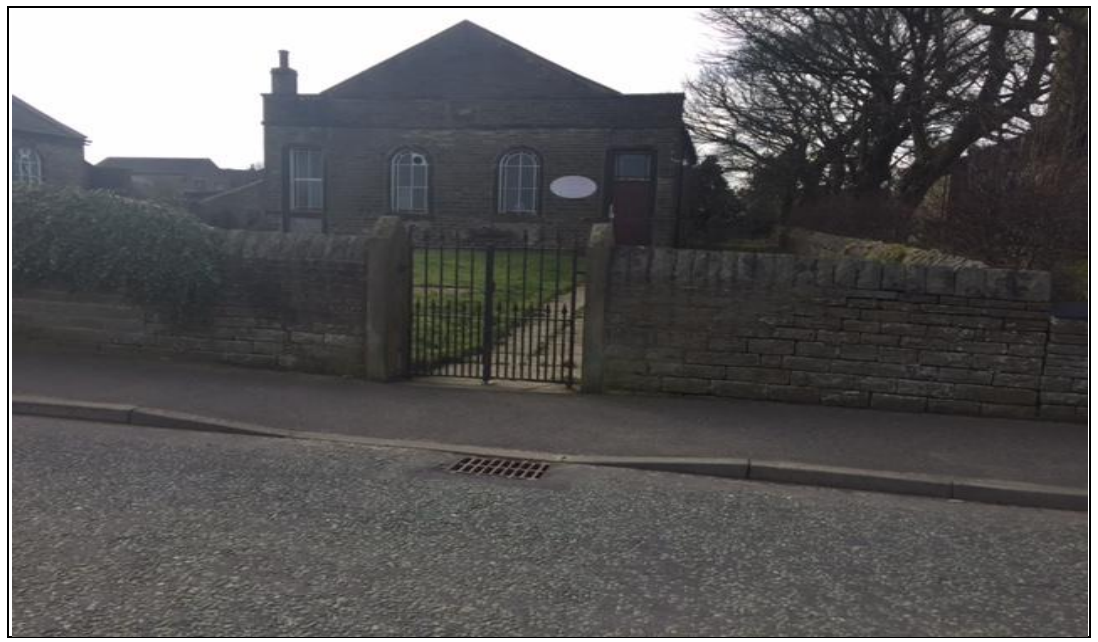
Hade Edge Methodist Chapel

7.16 In conclusion and having regard to national and local policy guidance, the proposed development would not be detrimental to the character, setting or appearance of the Listed Buildings.