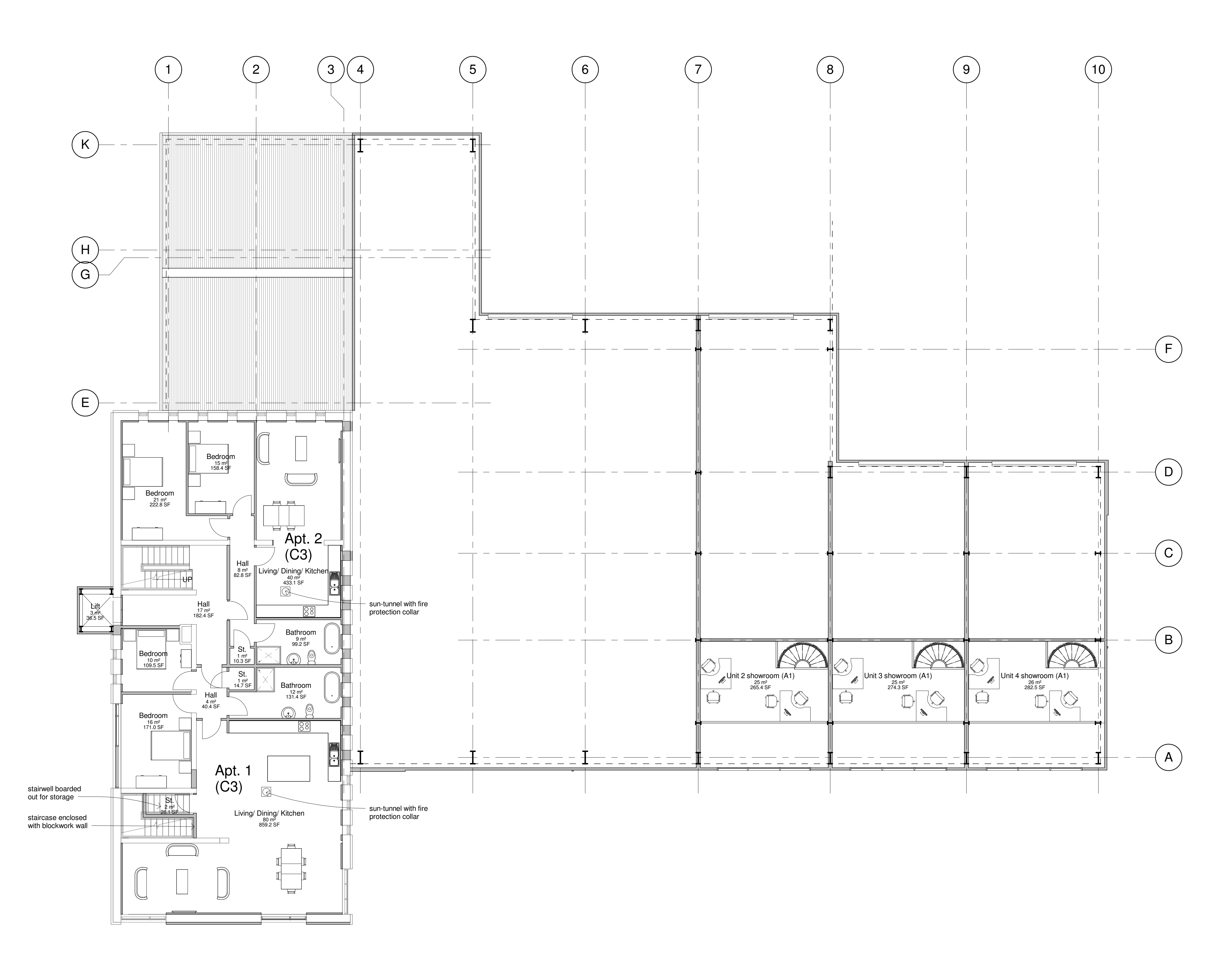
PROPOSED FIRST FLOOR 1:100