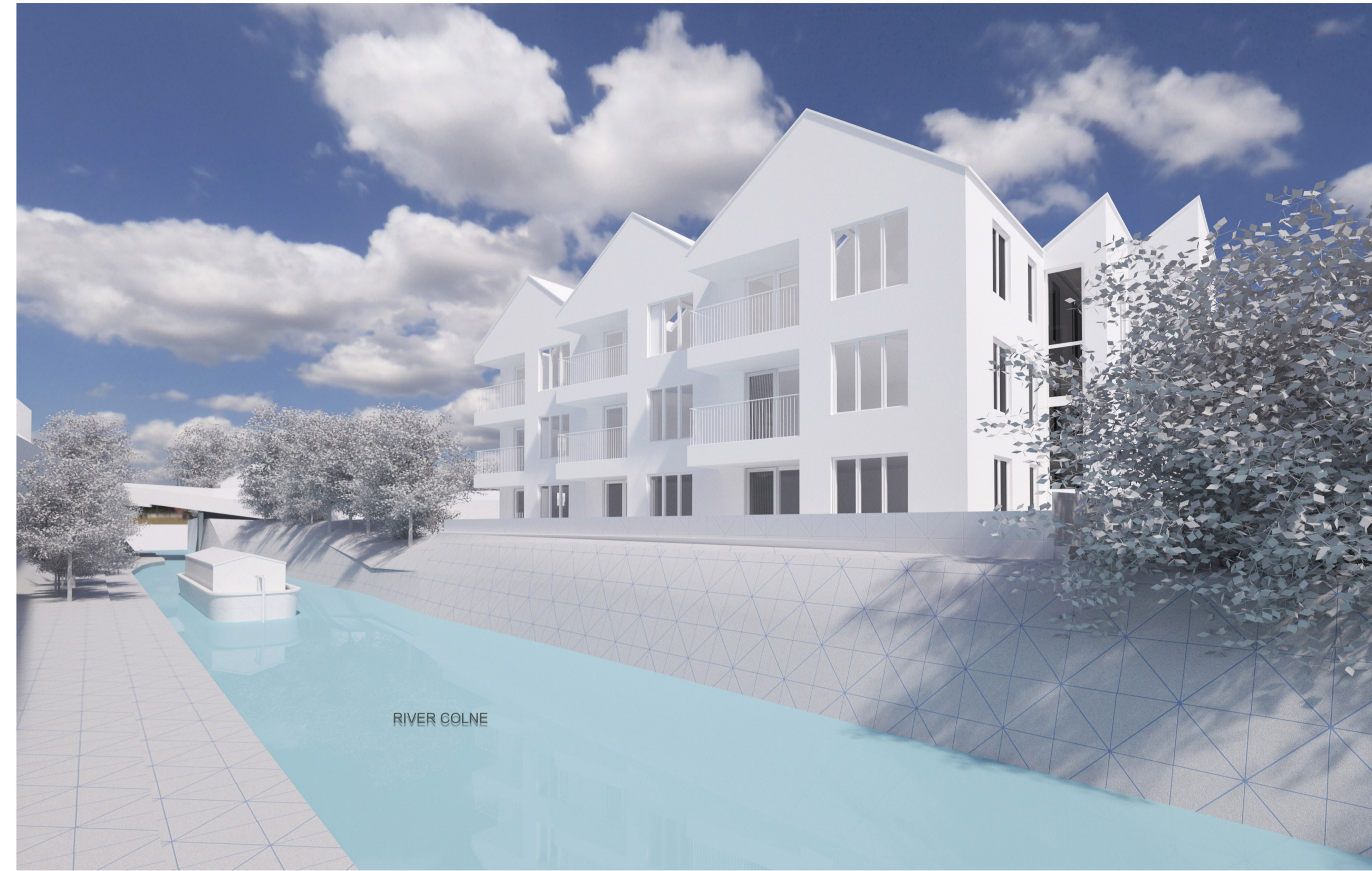
ABOVE - VIEW FROM RIVER COLNE PATHWAY ADJACENT TO PROPOSED BUILDING