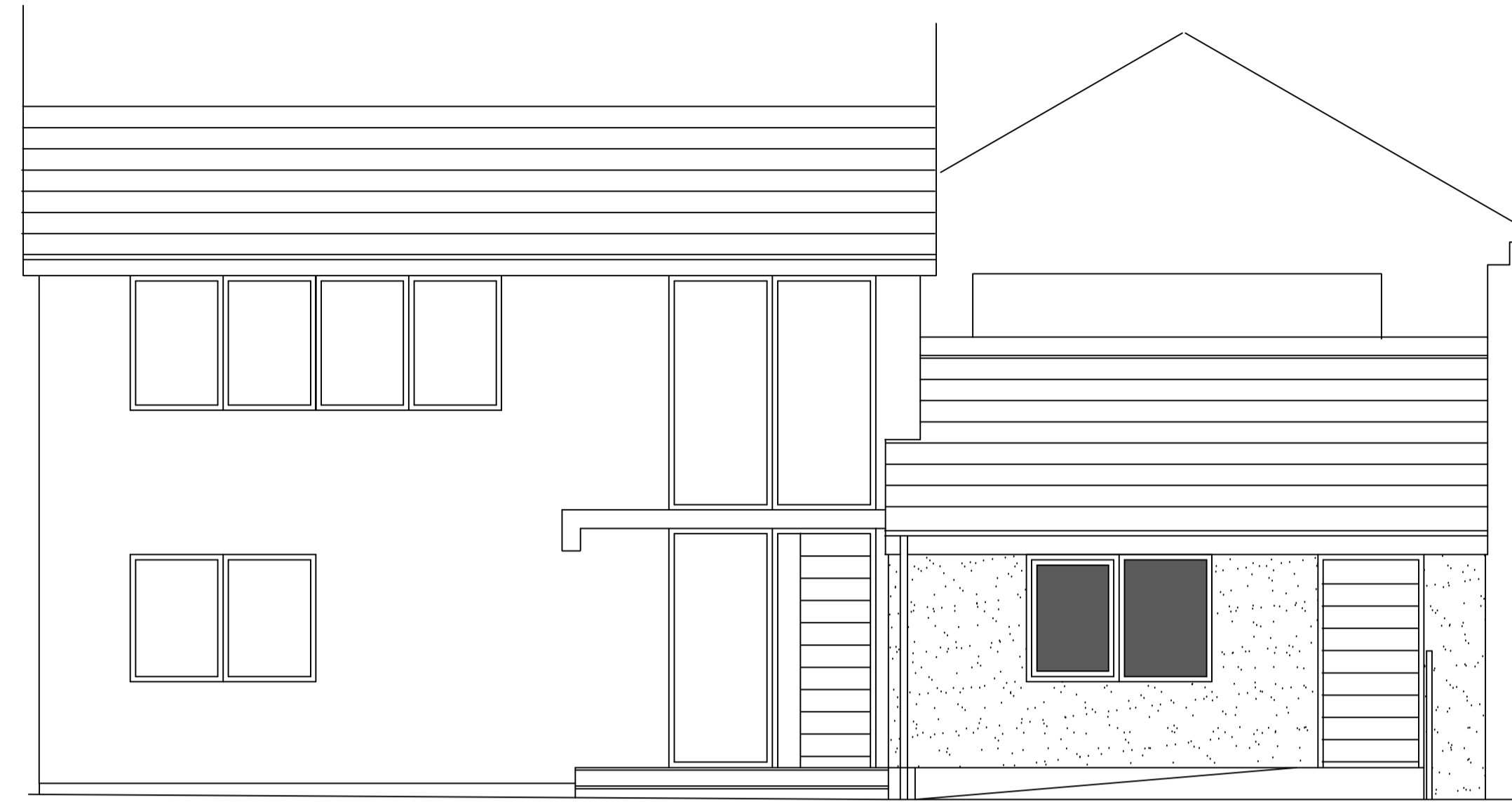
PROPOSED PART FRONT ELEVATION

IF IN ANY DOUBT PLEASE ASK THE ARCHITECT FOR CLARIFICATION. DO NOT SCALE FROM DRAWING. ALL DIMENSIONS TO BE CHECKED ON SITE. THE COPYRIGHT FOR THESE DRAWINGS REMAINS THE PROPERTY OF THE ARCHITECT. THEY MUST NOT BE REPRODUCED IN ANY WAY WITHOUT THE ARCHITECTS PRIOR WRITTEN CONSENT.