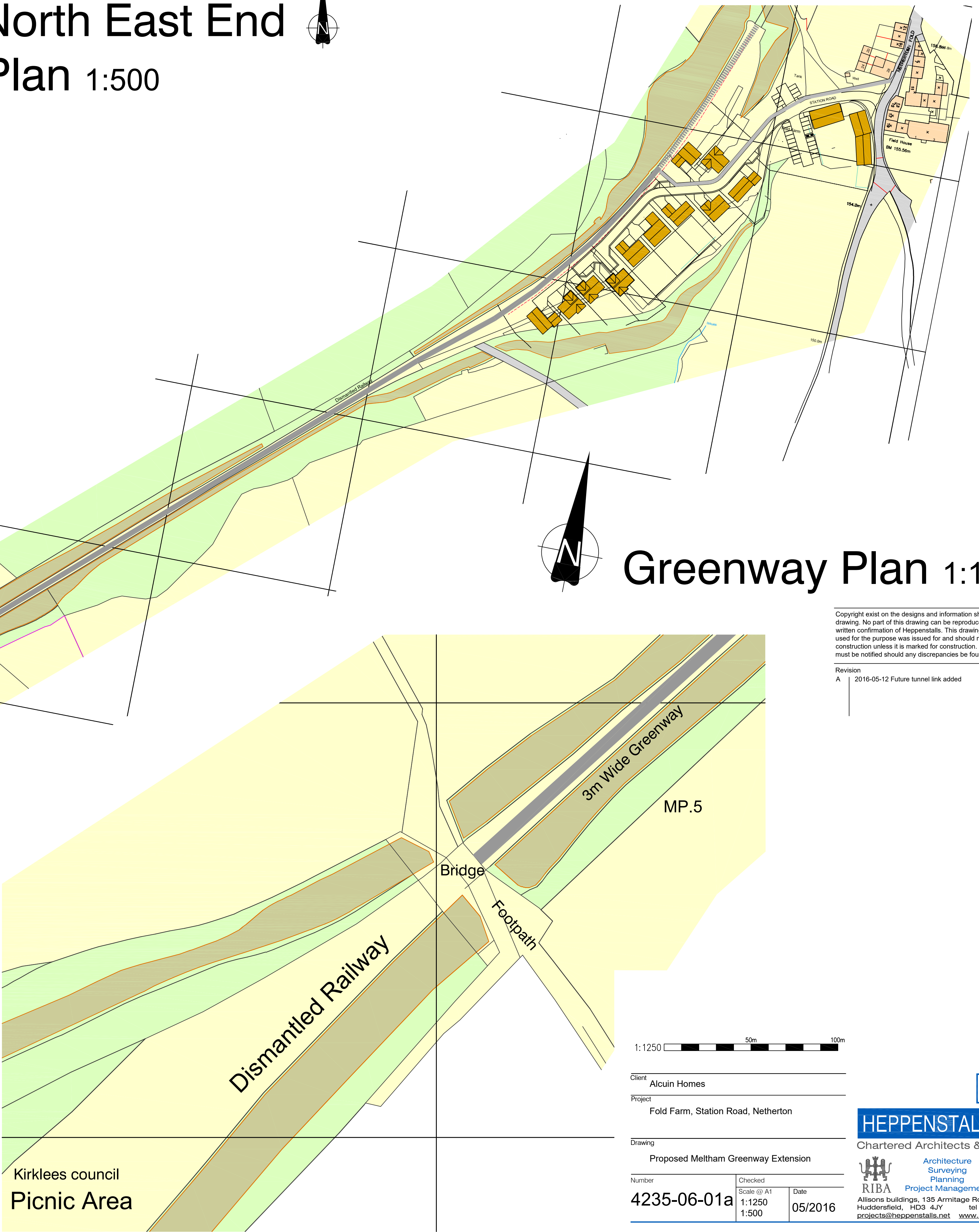
Greenway Plan 1:1250