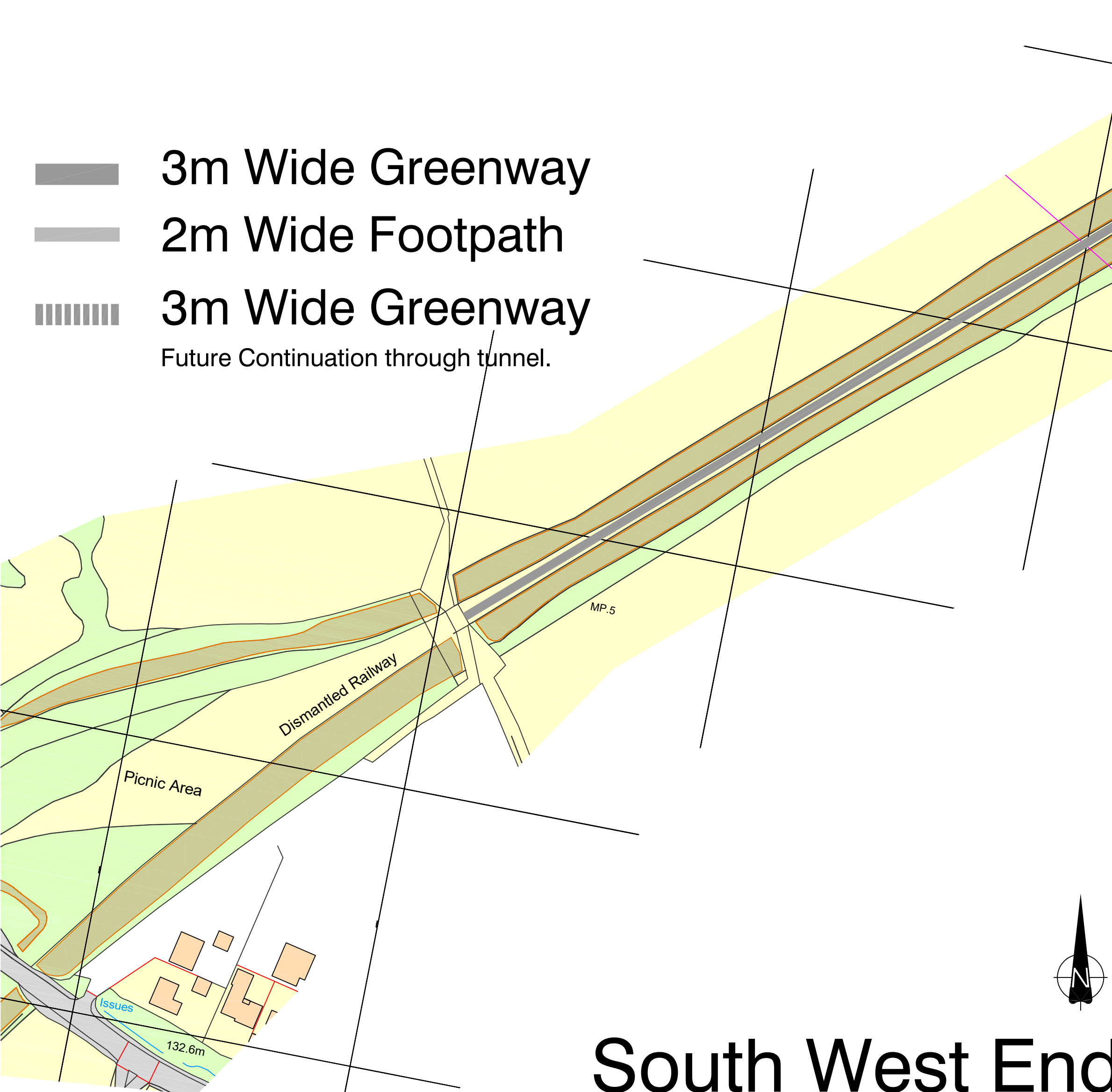
South West End Plan 1:500