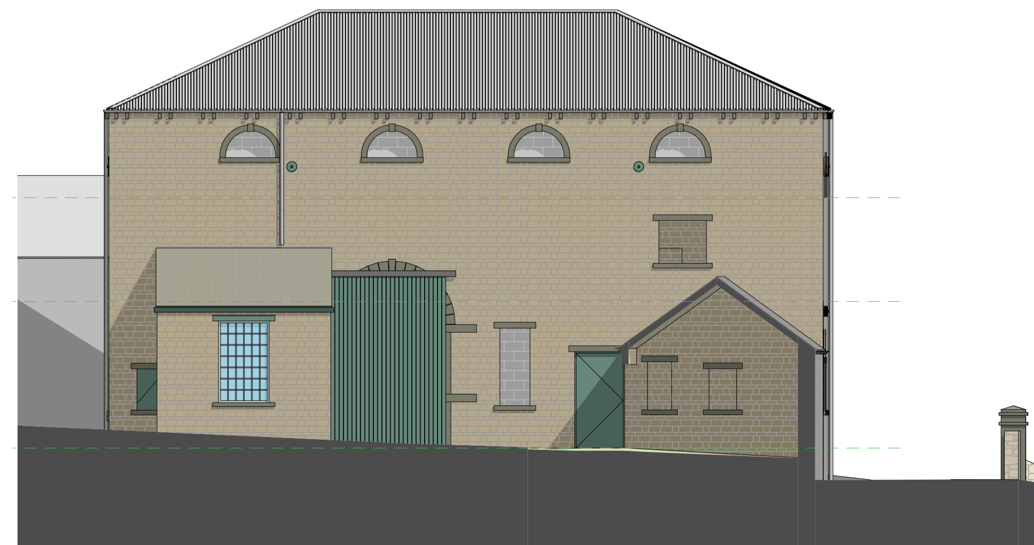
Barn 3 East (courtyard) Elevation 1:100