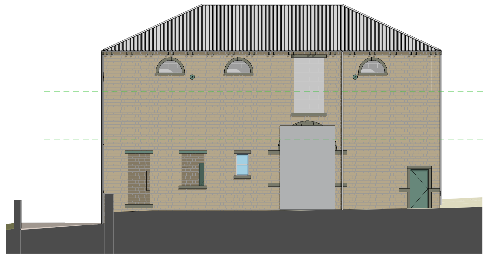
Barn 1 West (front) Elevation 1:100