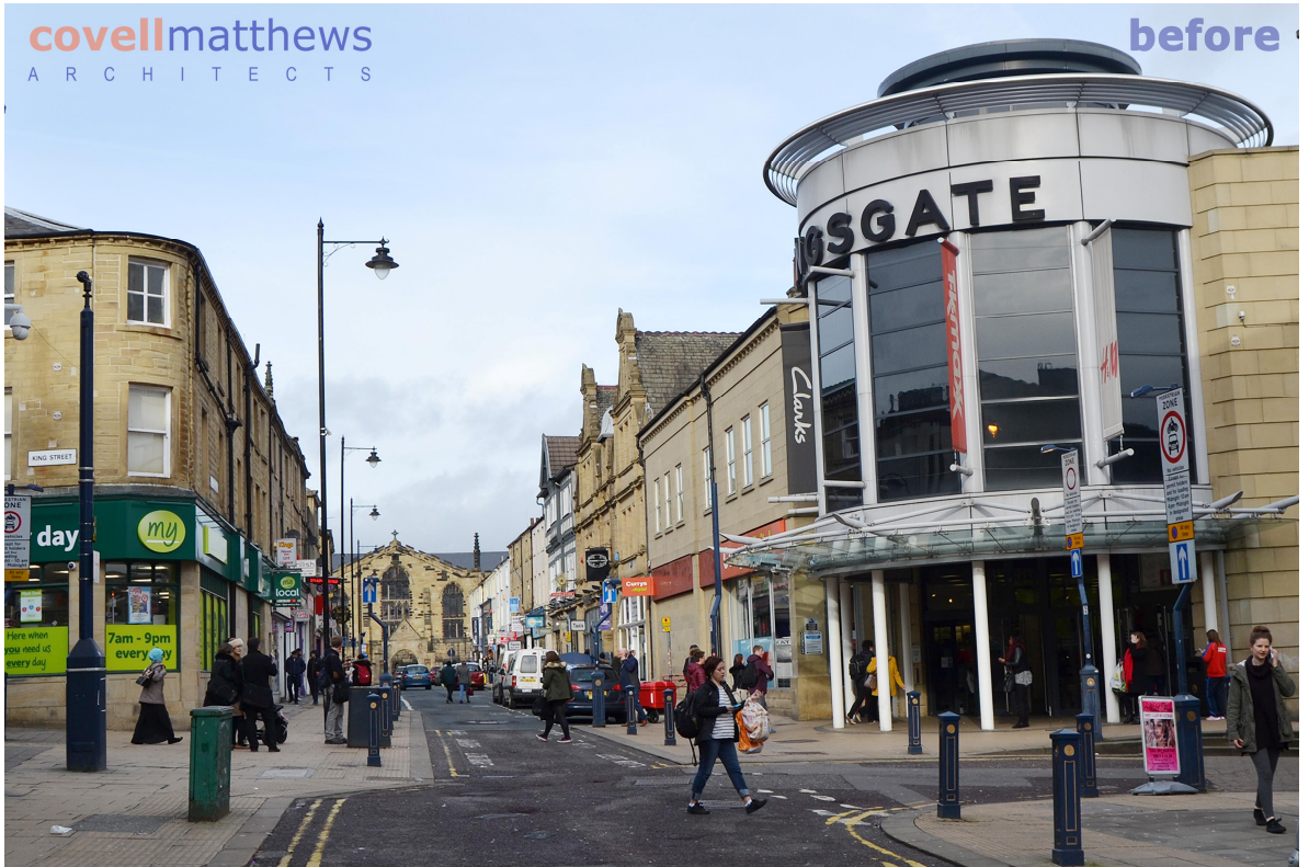
Existing view north from main entrance towards proposed development entrance