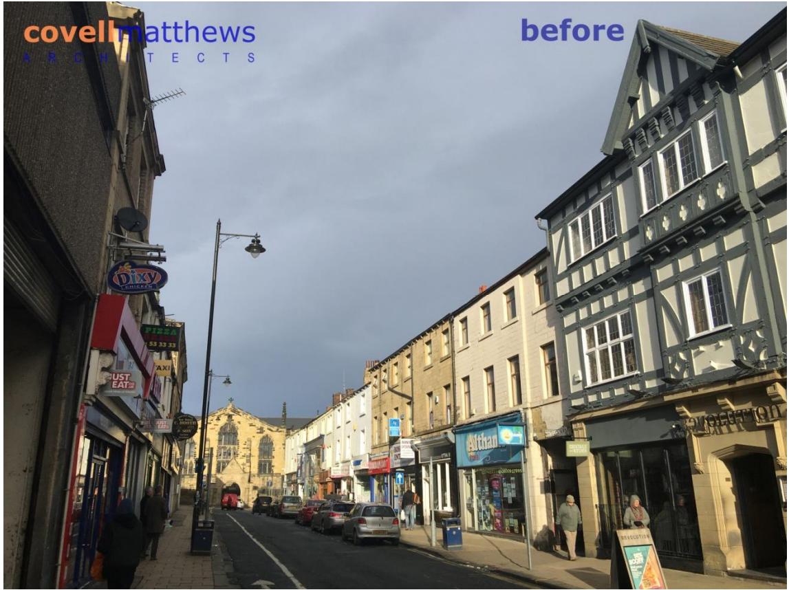
Existing view north towards proposed development entrance