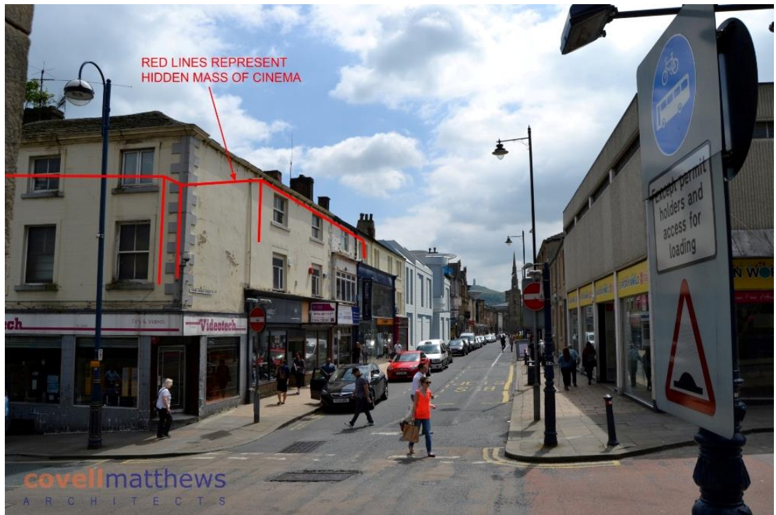
Public Consultation CGI Church Street looking East from St Peter's Church