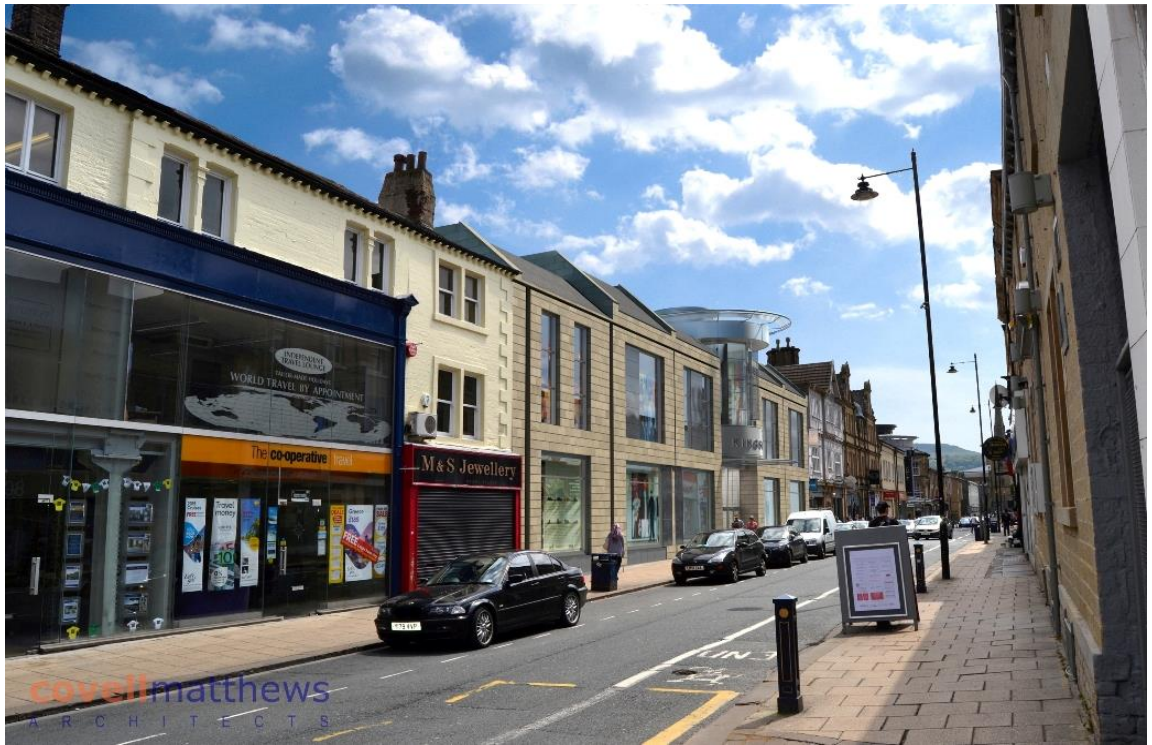
Public Consultation CGI Church Street NW looking South