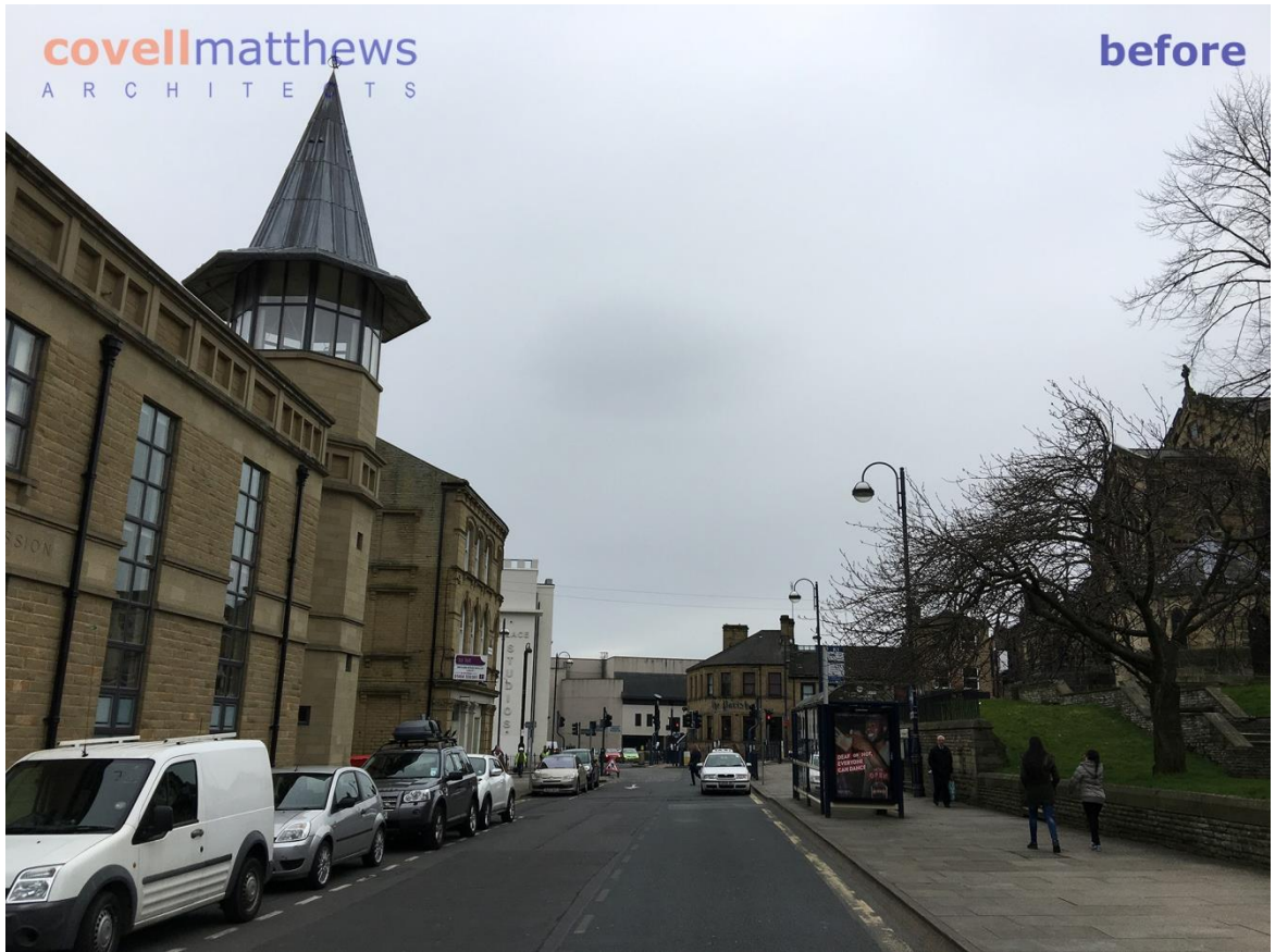
Existing view south from Lord Street towards Venn Street and the existing Kingsgate Centre.