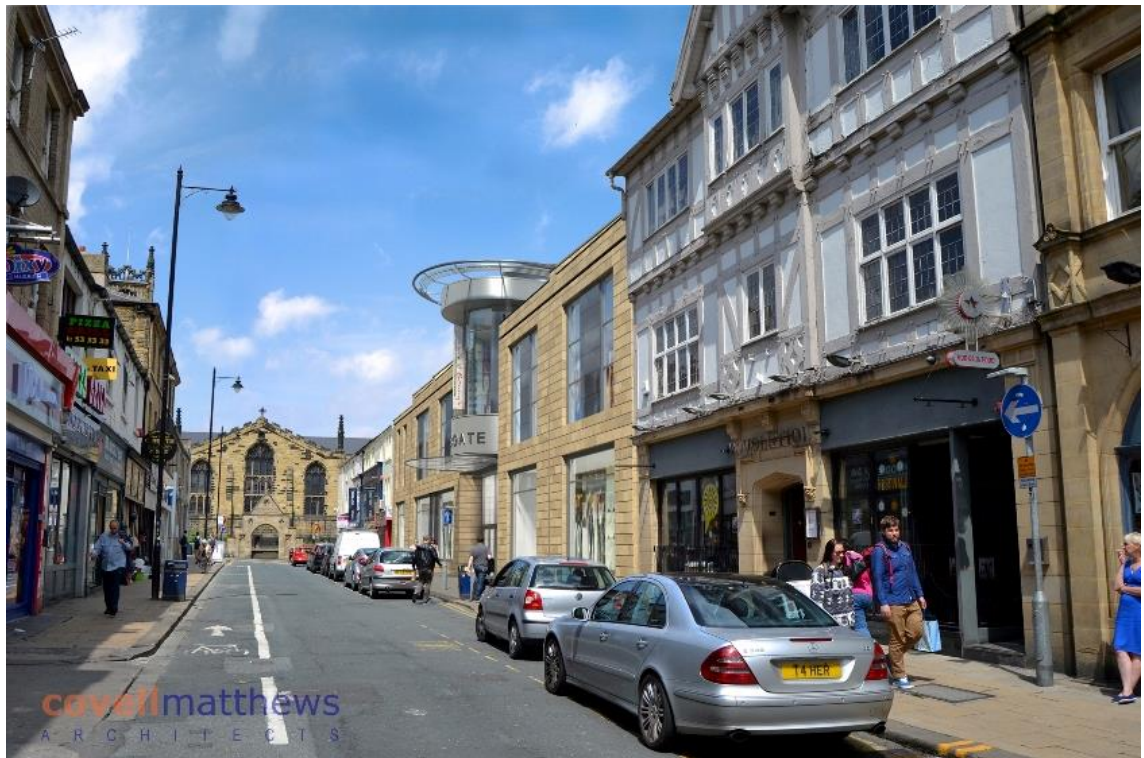
Public Consultation CGI Church Street NW looking North