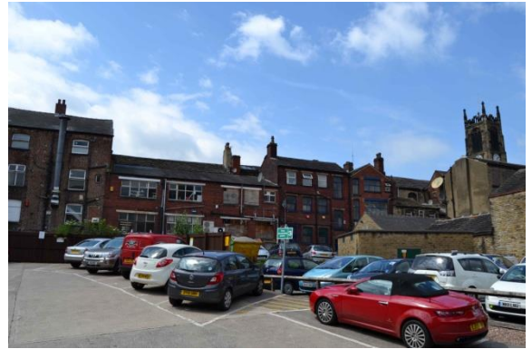
Photo 4 – Fleece Yard