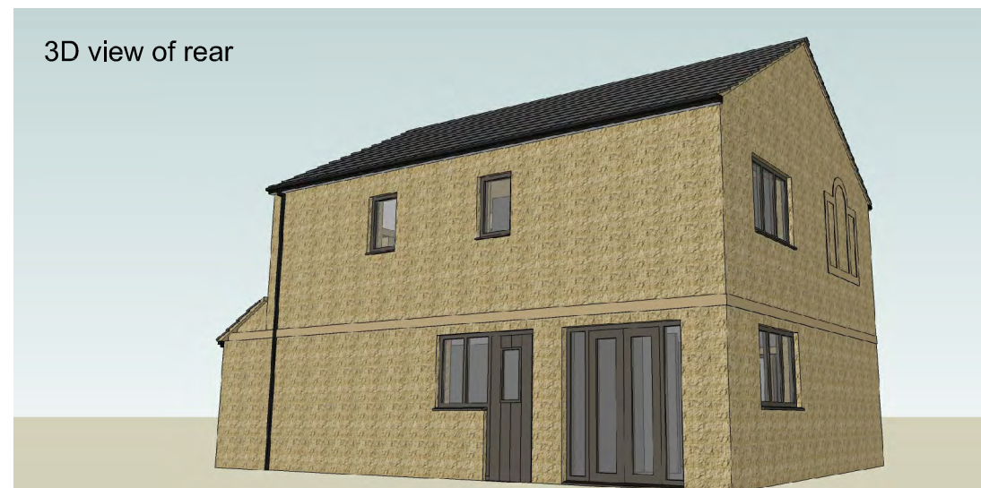
3D view of rear