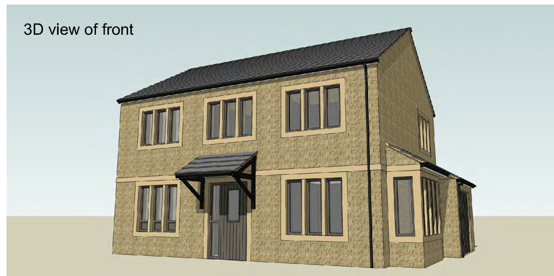
3D view of front